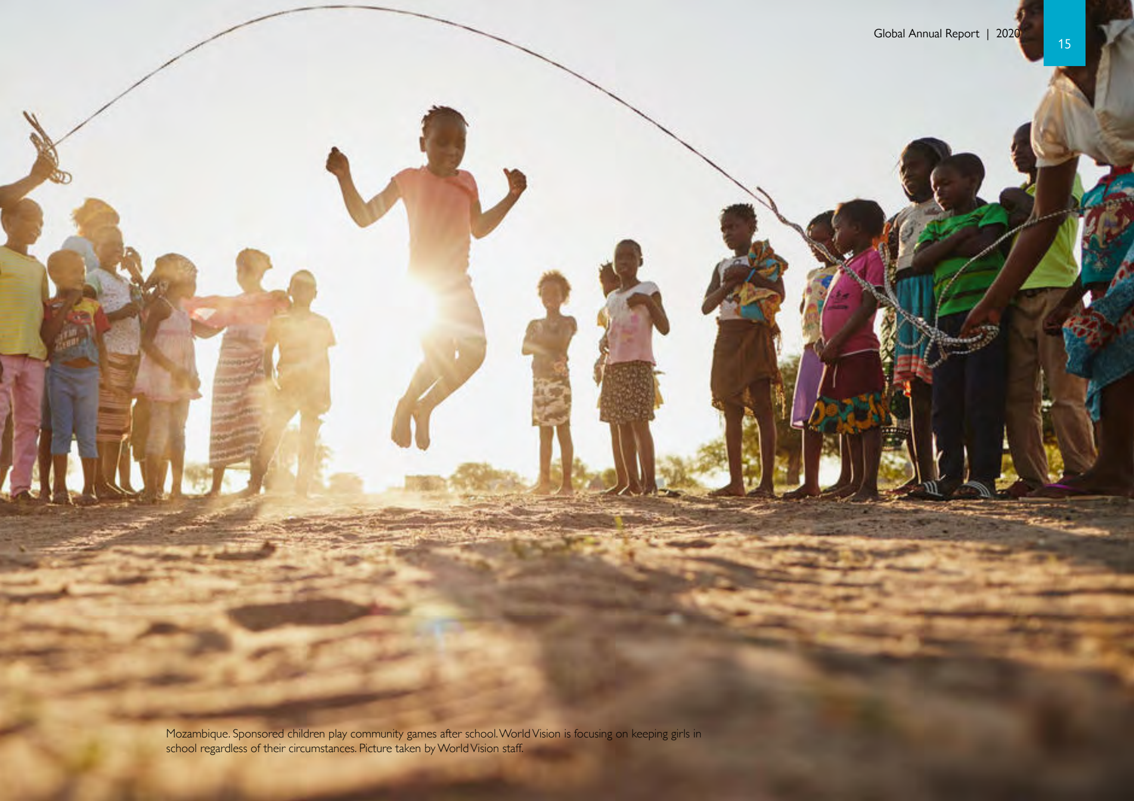
Mozambique. Sponsored children play community games after school. World Vision is focusing on keeping girls in school regardless of their circumstances.