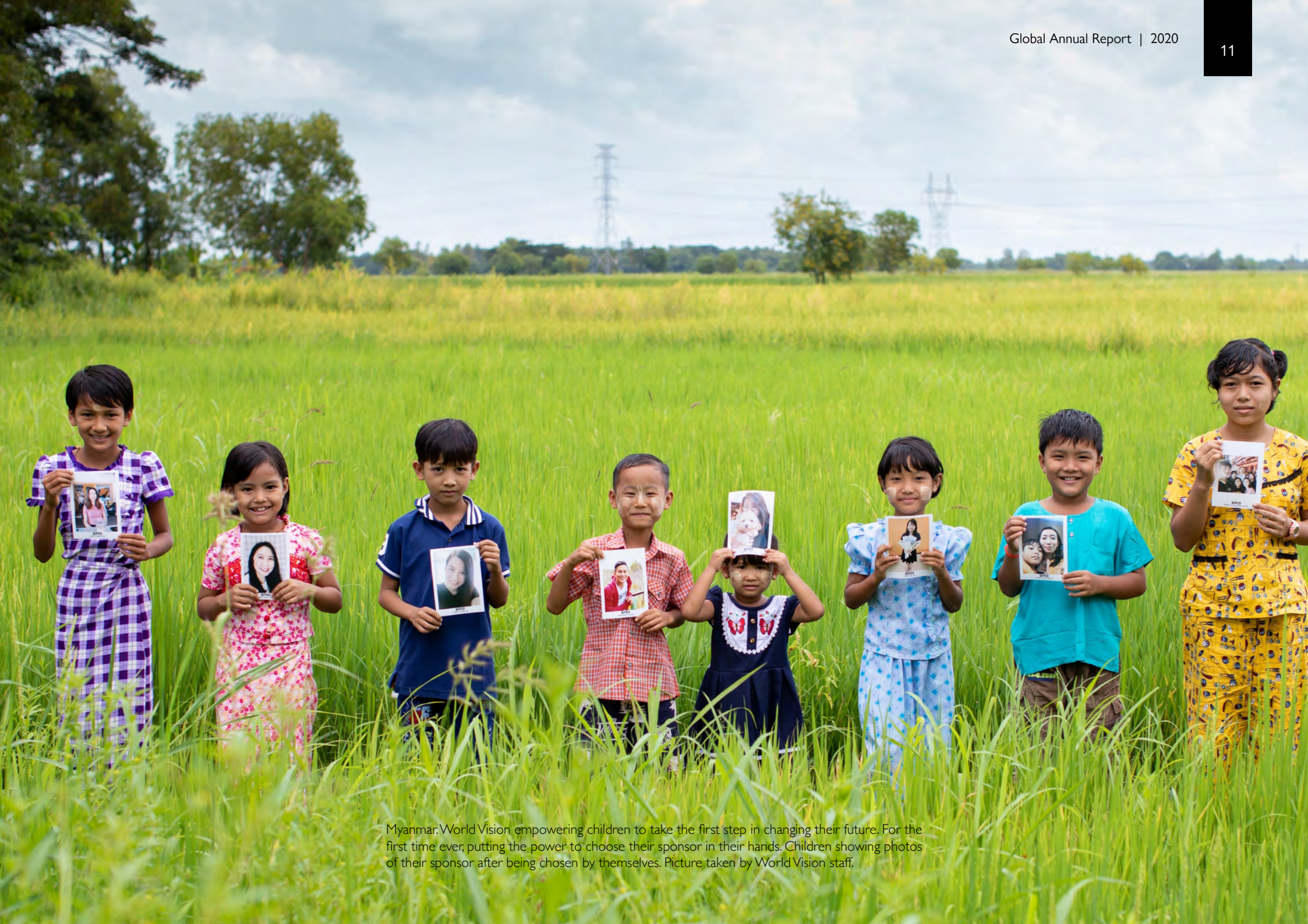
Myanmar. World Vision empowering children to take the first step in changing their future. For the first time ever, putting the power to choose their sponsor in their hands. Children showing photos of their sponsor after being chosen by themselves.