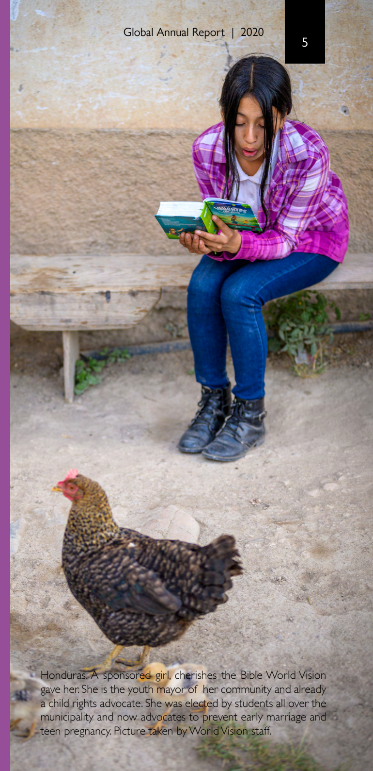
Honduras. A sponsored girl, cherishes the Bible World Vision gave her. She is the youth mayor of her community and already a child rights advocate. She was elected by students all over the municipality and now advocates to prevent early marriage and teen pregnancy.

Our work reaches children no matter their background or if they live in the most dangerous of places.