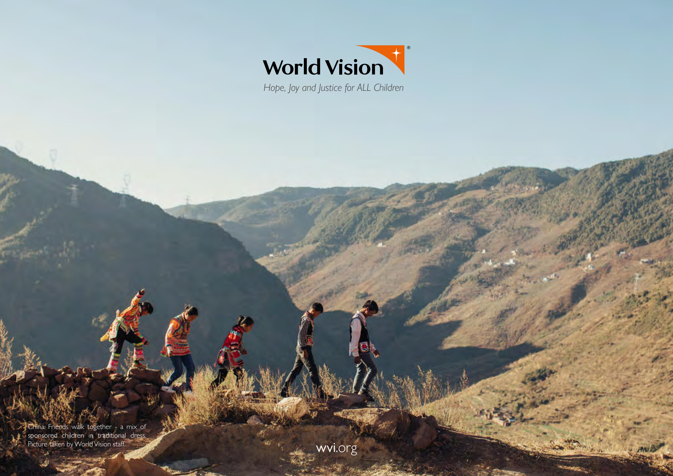
China: Friends walk together - a mix of sponsored children in traditional dress.