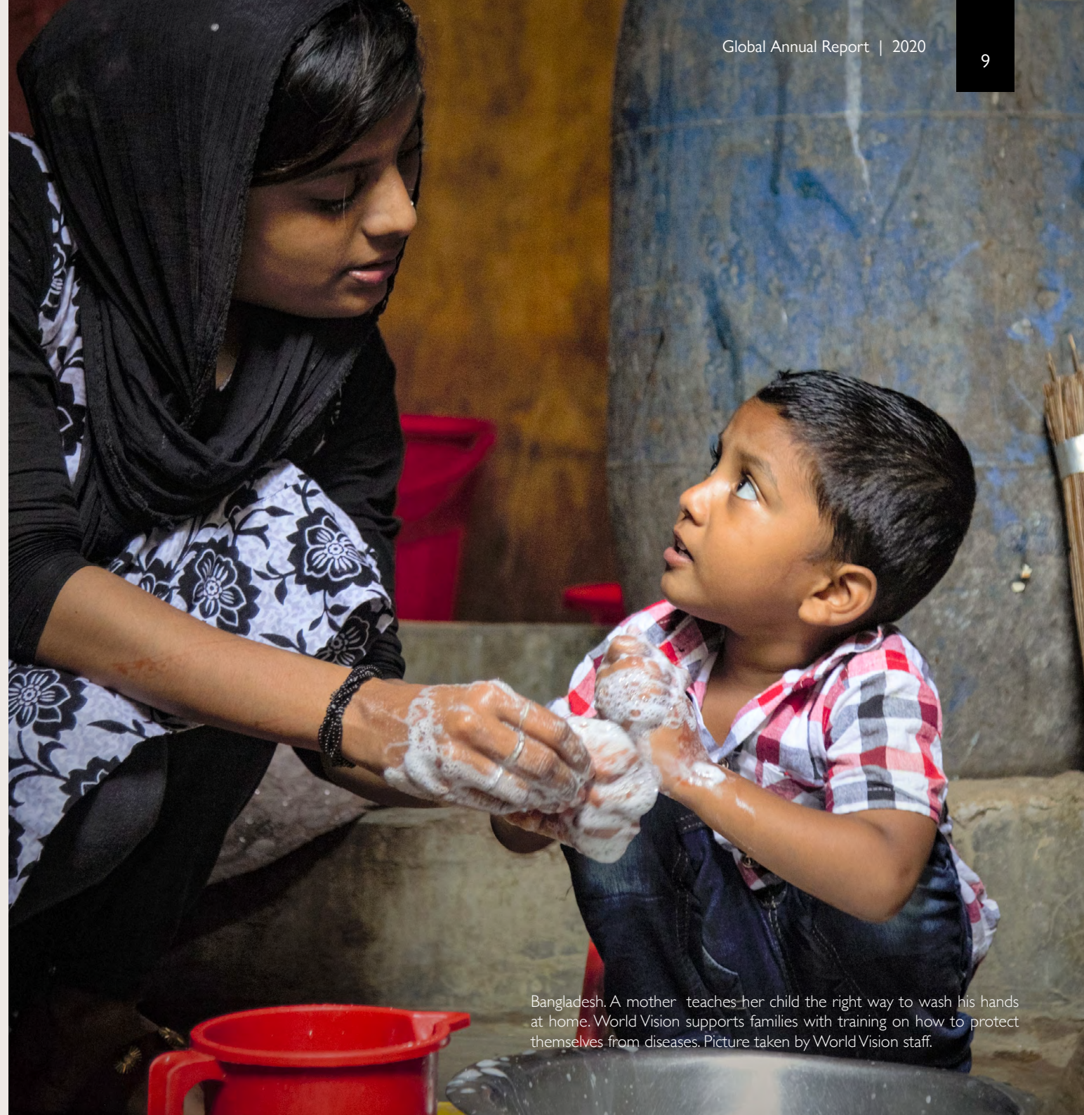
Bangladesh. A mother teaches her child the right way to wash his hands at home. World Vision supports families with training on how to protect themselves from diseases.