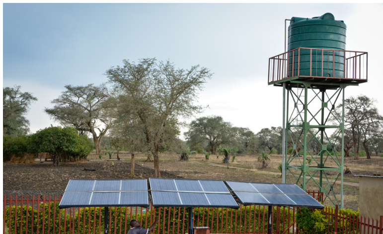
The mechanised water system is made up solar panels, pipes, pump, tank and switch.

Notably, piped-water systems have played an important role in equipping health care facilities with water and sanitation services in our operating areas, addressing a critical gap in the quality of care in rural health care facilities by piping water directly to points of care for hand-washing, bathing rooms for mothers after delivery, and flush toilets for all patients.