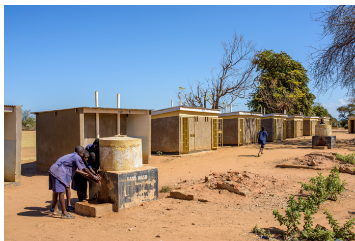
Latrines and hand-wash stations built by World Vision Zambia at Malima Primary School, Sinazongwe Area Programme

To date communities reached include Madzimawe in Chipata; Muchila in Namwala; Kabulwebulwe in Mumbwa and Mwamba in Mbala districts.