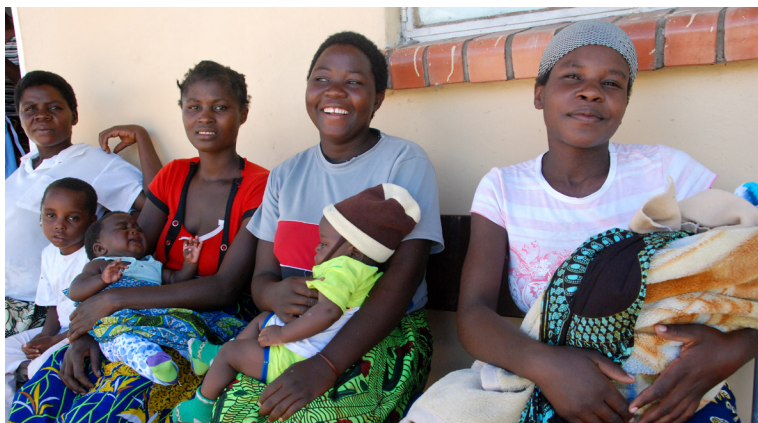
TTC targets pregnant and lactating women, including children under the age of 2. It aims to increase the number of women delivering at health facilities and children receiving immunizations.

1. Timed and Targeted Counselling (TTC): A family inclusive behavior change model that targets pregnant women, caregivers, and parents of children up to two years of age through appropriately timed household visits. TTC trains community health workers in accurate, preventive, care-seeking information and support to create demand for services and empower families to improve health outcomes and practices. Since 2017, 87,180 pregnant women were enrolled in TTC interventions against a target of 79,000. In addition, 74,473 children under the age of 2 have completed the TTC programme at 24 months since 2017.