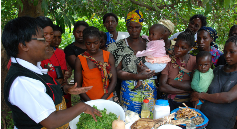
Mothers with underweight children attend cooking demonstration supported by World Vision.

communities on issues around HIV prevention, gender and child wellbeing. COH equips faith leaders with Biblical information and insight guiding them to become influential change agents. Faith leaders and community members are equipped to take practical actions in prevention, care and advocacy in order to promote community wellbeing for the most vulnerable in their communities.