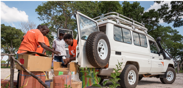
World Vision Zambia staff deliver GIK pharmaceuticals to Mwandansengo Rural Health Post in Luampa District

Through Gifts in Kind, World Vision Zambia acquires and distributes drugs and supplies. Between 2017 - 2019, 4.5 million Vitamin A capsules and 13.4 million Malbendazole deworming tablets were distributed during Child Health Weeks to meet the Government gap in 2012. In the past, we have received and distributed 37,125 malaria rapid diagnostic test kits; 8,055 first line malaria treatment regimens for children and youth; tablets for intermittent presumptive treatment for 22,175 pregnant women; and over 300,000 Insecticide Treated Nets in six districts - Kafue, Chilanga, Chongwe, Rufunsa, Kalulushi and Lufwanyama.