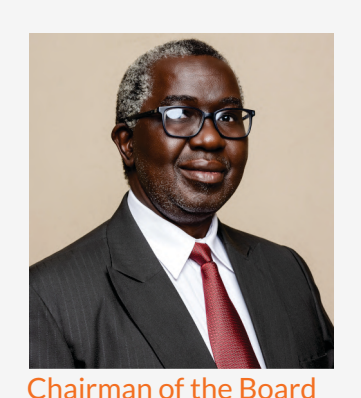
of Directors (outgoing)