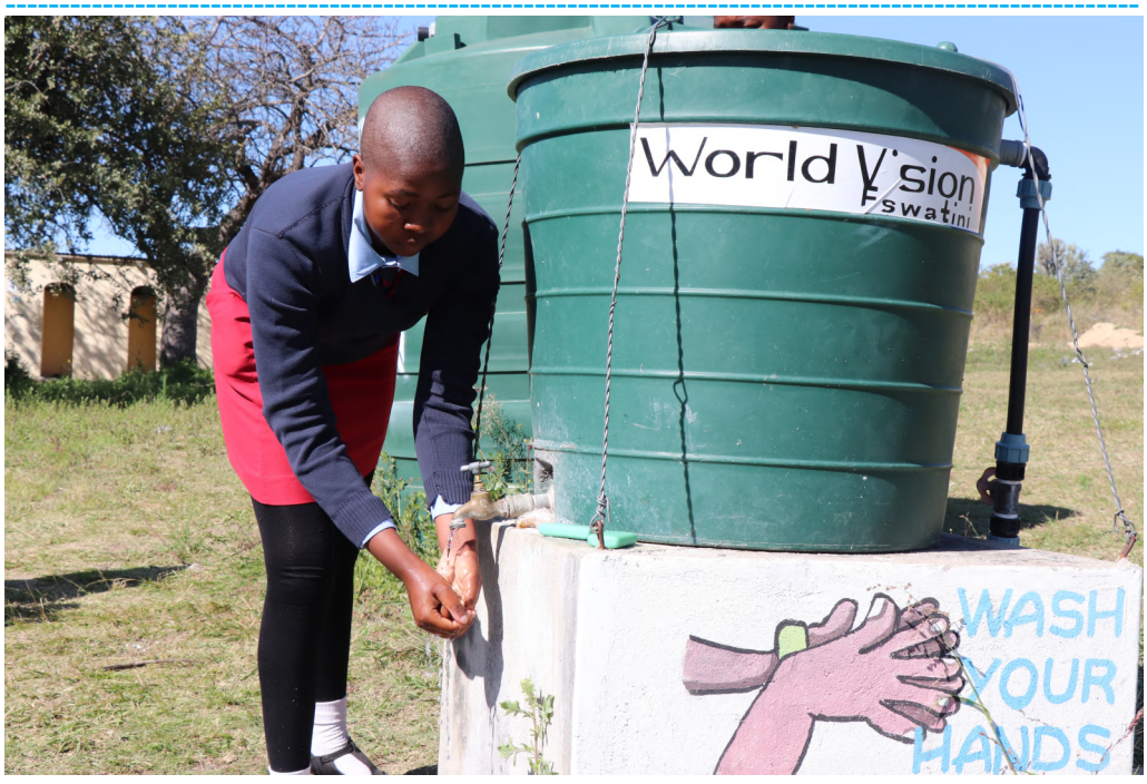
A learner from Madlangempisi High School washing her hands at a water supply point provided by WV Eswatini as part of its water, sanitation and hygiene (WASH) programme.

people with access to household handwashing facilities