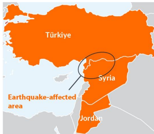
Map of World Vision Syria Response countries – showing earthquake-affected area

World Vision is rapidly responding to the 6 February earthquake's impact in Syria and Türkiye. So far, it has dispersed funding to 15 partners across both countries. In North West Syria, WV mobilized its team within hours of the first quake, allowing for a rapid response to immediate needs. This prompt response from World Vision and its partners has meant that over 50,000 people who needed life-saving assistance in the first few weeks of the earthquake's aftermath were able to get it.