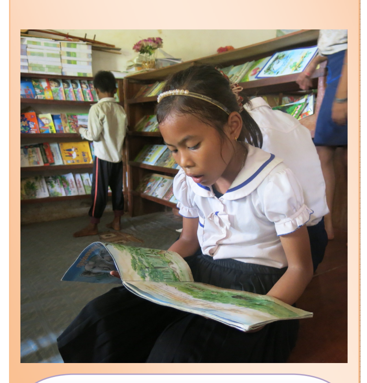
Children reading book in the school library in Battambang