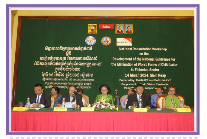
At the opening of the national stakeholder workshop on the finalization of the national guidelines for the elimination of worst forms of child labor in fisheries sector, on 14 March 2014 in Siem Reap.