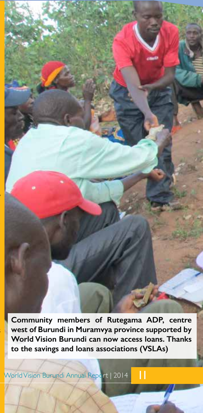
Community members of Rutegama ADP, centre west of Burundi in Muramvya province supported by World Vision Burundi can now access loans. Thanks to the savings and loans associations (VSLAs)

Last year VSLAs revealed themselves to be a tremendous milestone achievement in World Vision Burundi's ministry. Using VSLAs, "our bank for poor people", 18,558 community members were able to save 322,765,364 Fbu (201,000$US) that allowed them to access a total of 314,856,321 Fbu (196,800$US) of credits invested to start new businesses or respond to households needs.