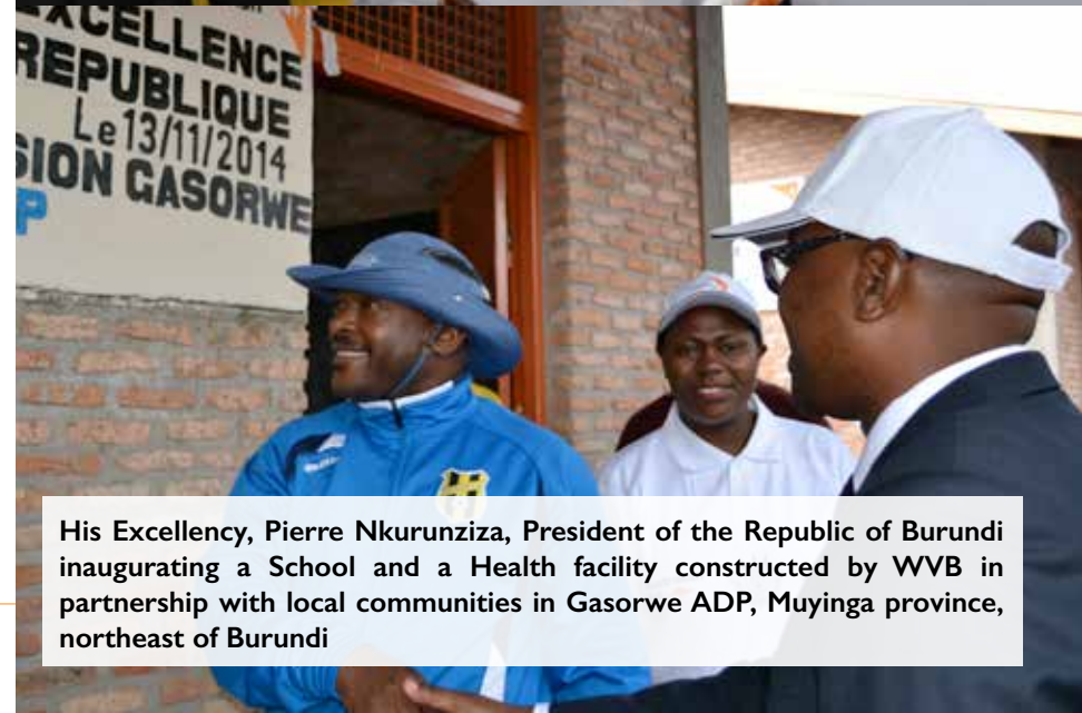
His Excellency, Pierre Nkurunziza, President of the Republic of Burundi inaugurating a School and a Health facility constructed by WVB in partnership with local communities in Gasorwe ADP, Muyinga province, northeast of Burundi