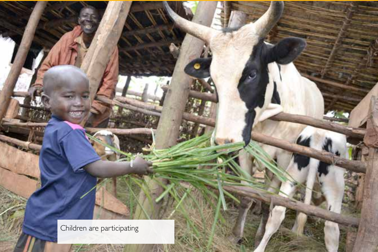
Children are participating

The child well-being aspirations describe a good life for children, affirming our desire for children to experience life in all its fullness. World Vision International works with those who are the most vulnerable - the poor and the oppressed - regardless of the person's religion, race, ethnicity or gender.