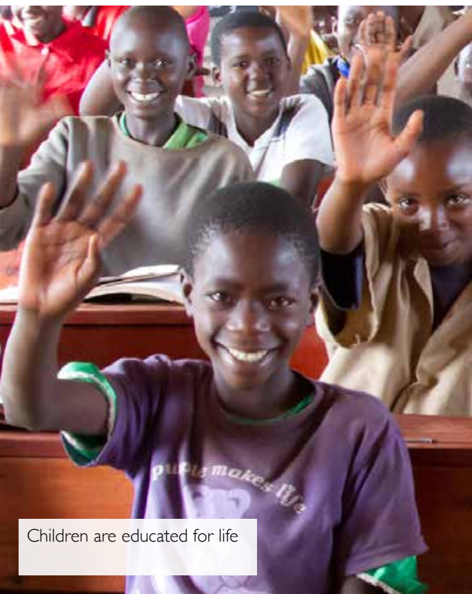
Children are educated for life