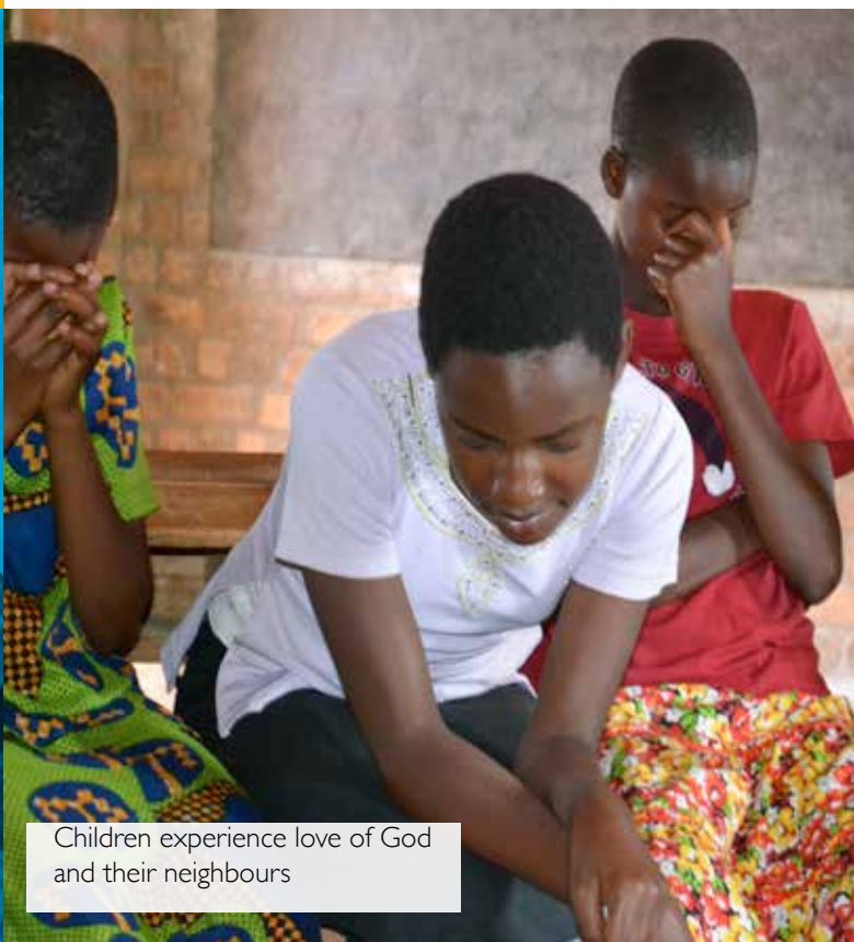
Children experience love of God and their neighbours