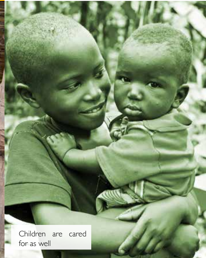
Children are cared for as well