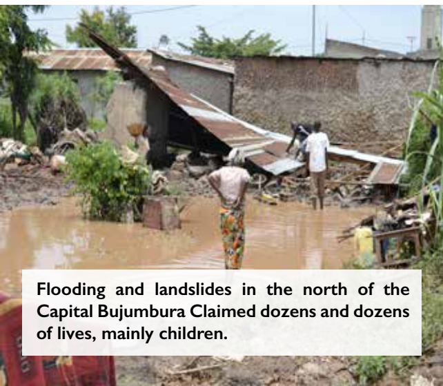
Flooding and landslides in the north of the Capital Bujumbura Claimed dozens and dozens of lives, mainly children.

Burundi is one of the 'red zone' countries identified by both FAO and WFP as being among the most affected by soaring food prices. After so many years of conflict, the capacity of the government to respond to this new challenge is limited. Burundi is also prone to natural disasters. Floods, hailstorms, drought and torrential rain are recurrent in Burundi. In recent years, the country has registered an unusually high number of natural disasters which have contributed to the displacement of communities, the destruction of homes, the disruption of livelihoods and the further deterioration of food and nutrition security. Burundi was also characterised by cyclic wars since its independence until recently in 2005 with the peace accords. Thousands of people who were displaced or fled to neighbouring countries for their safety have been voluntarily returning or expelled by host countries and come back in urgent need of assistance.