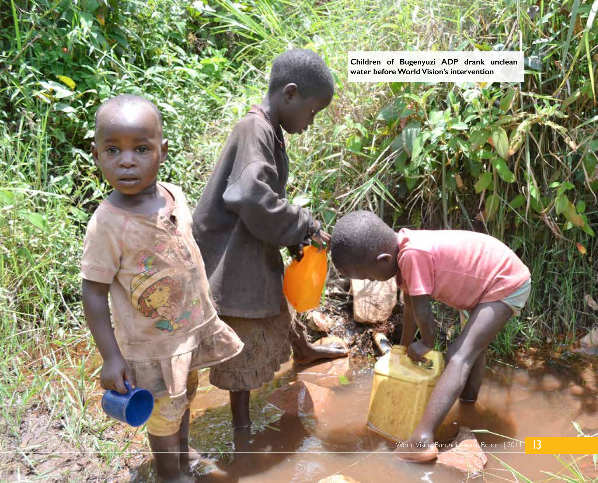
Children of Bugenyuzi ADP drank unclean water before World Vision's intervention