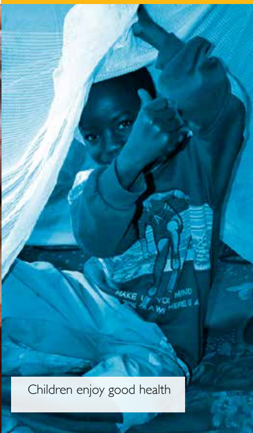
Children enjoy good health