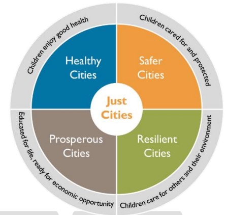
Figure 1: The Cities for Children Framework

“Cities for Children” is WV’s emerging framework for addressing children’s vulnerabilities in urban contexts. 1 It is anchored in WV’s Child Wellbeing Aspirations 2 and links with tested urban approaches developed by various UN agencies. It consists of four inter-related domains of change that are essential to the wellbeing of urban children: healthy, prosperous, safer and resilient cities. Underpinning these domains is the enabling factor of advocacy; seeking justice and inclusion of the most vulnerable, promoting equity for all through Just Cities for Children. Each of the four domains identifies an aspirational goal to address unique issues of the city (Box 1).