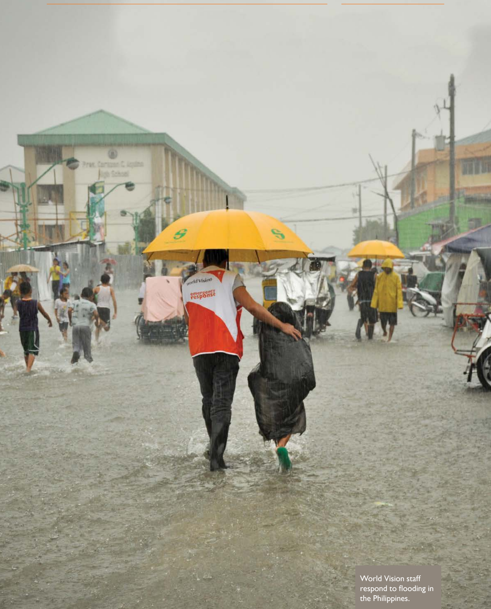
World Vision staff respond to flooding in the Philippines.