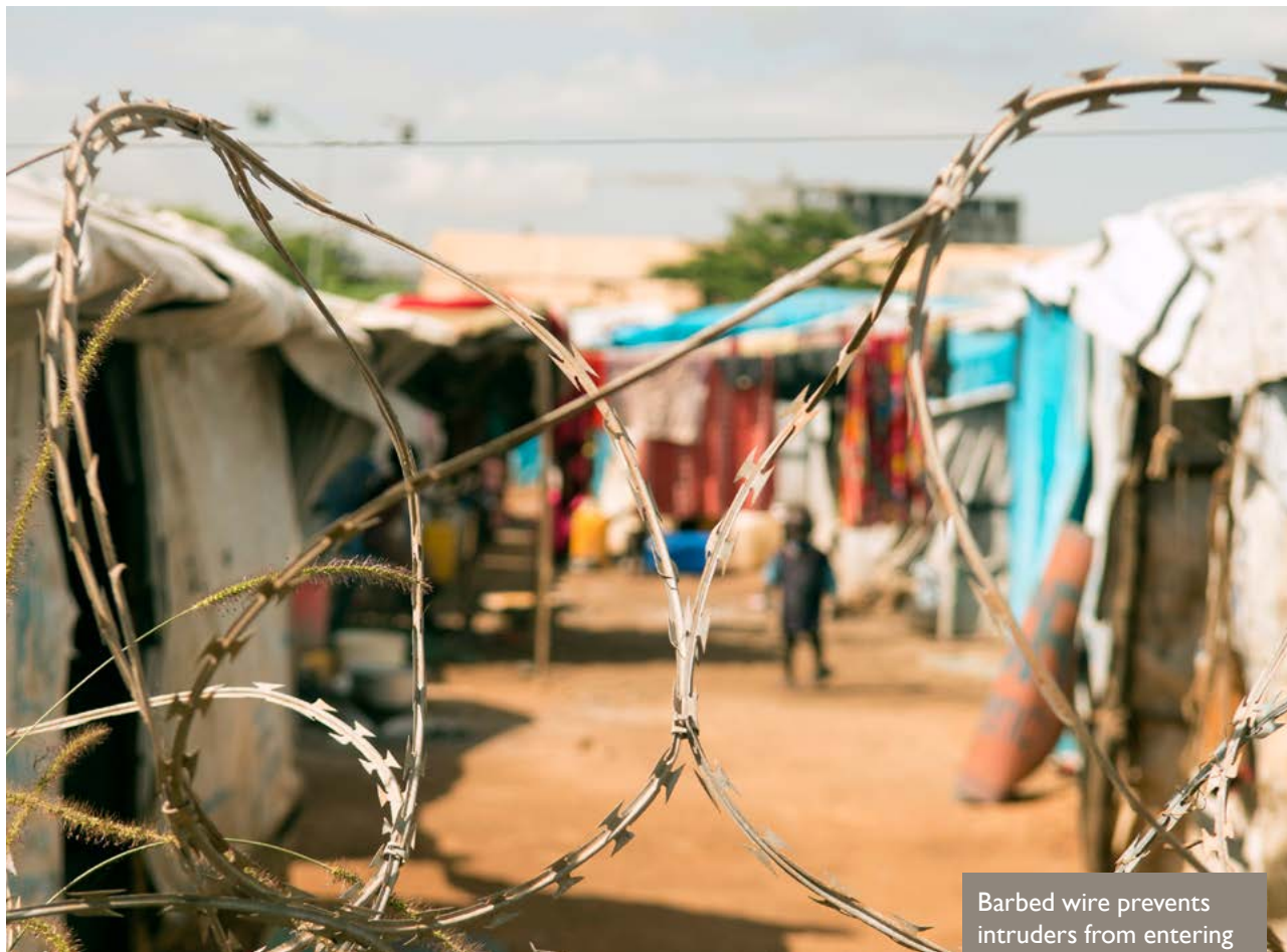
Barbed wire prevents intruders from entering an area built to protect people who have fled violence in Juba, South Sudan.

to review and compile a set of existing indicators that 1) can already apply to measuring impact of humanitarian action and 2) develop additional indicators that specifically focus on the impact of humanitarian action.