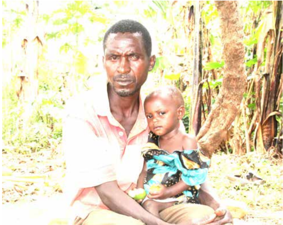
A shared parental responsibility for a disabled girl child.

According to the Office of The Prime Minister (OPM) by the end of October 2013, the population of Kyangwali was reported to be 33,150. The camp is divided into blocks in which there are 23-30 families. Over 98% of the population is dependent on crop farming from which both food and income are generated to supplement food rations provided by United Nations High Commission for Refugees (UNHCR) and prepare them for life after returning to their homes of origin.