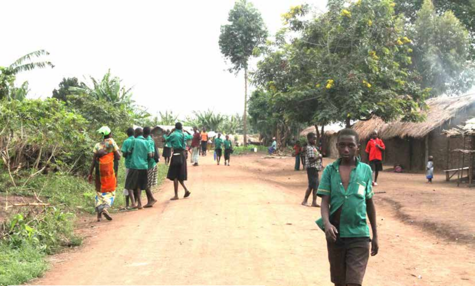
Children walking back from school in Kyangwali refugee settlement camp- Hoima.