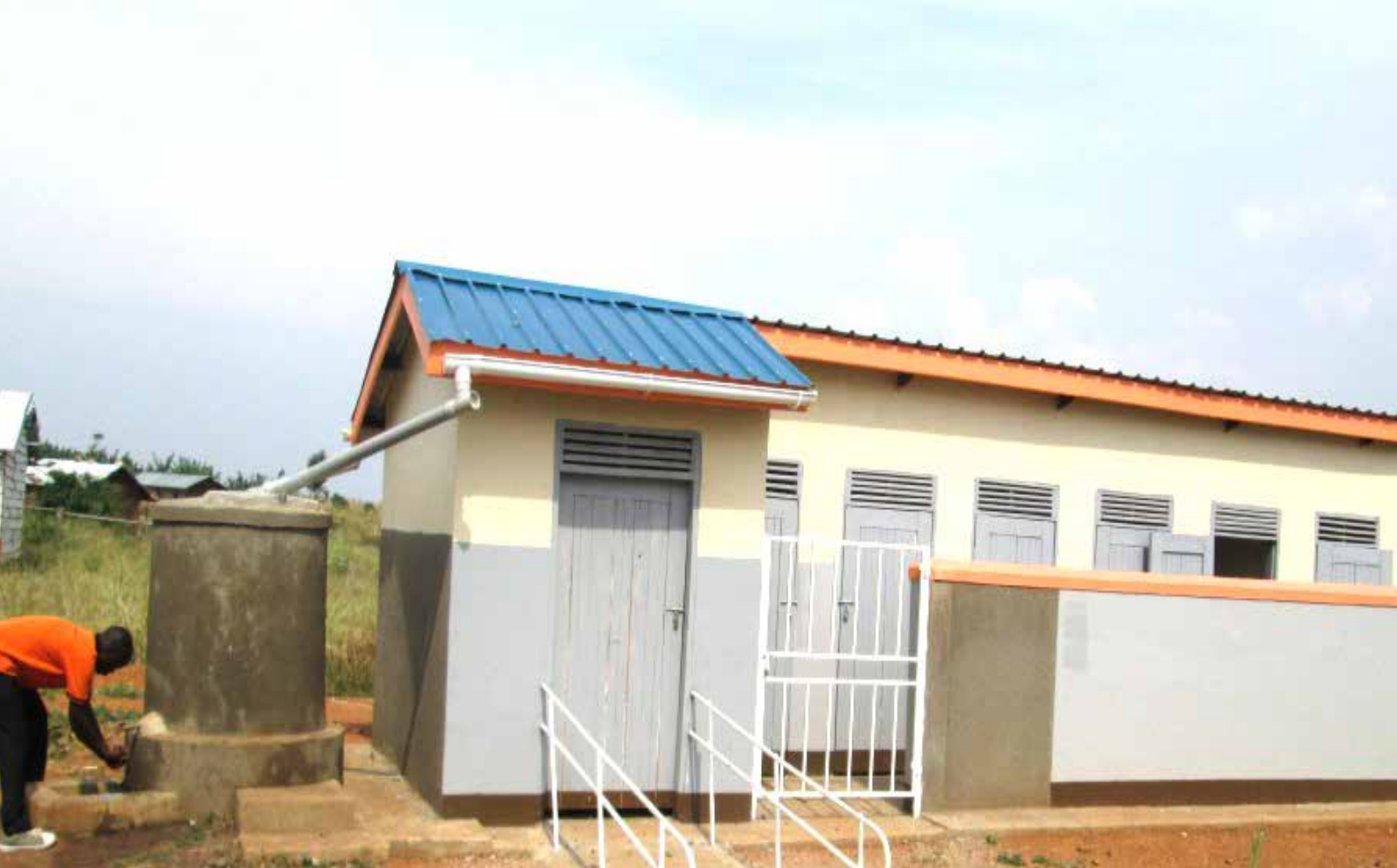
A school latrine built under the project with a ramp for the disabled and a rain water storage facility for washing hands and maintaining hygiene of the the latrine. This is one among the many latrines provided under the project in schools that has reduced the pupil stance ratio from 1:93 to 1:43.