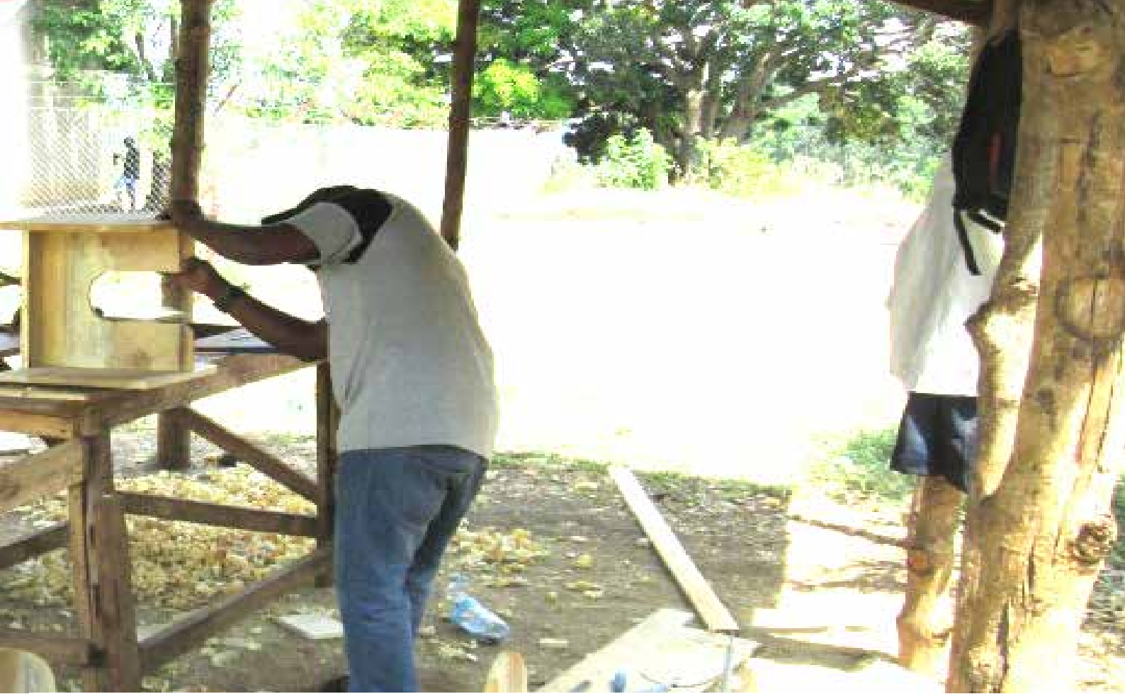
Local artisans producing different assistive devices that benefitted PWD's in Kyangwali resettlement camp.