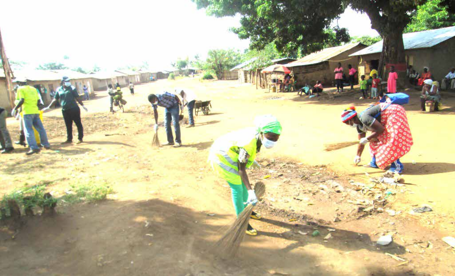
Members of the NGO's community participate in cleaning of the Kyangwali Trading Center.