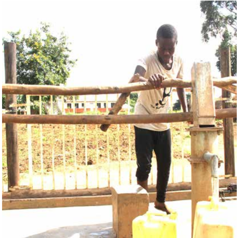
Able bodied people can also fetch water from boreholes constructed with facilities for PWDs.

WVU created awareness among all stakeholders on the need to mainstream issues of WASH for PWDs using drama groups which changed people's mind sets towards PWDs. Therefore this booklet is expressive of the successes registered in the 1 year of implementation of the project.