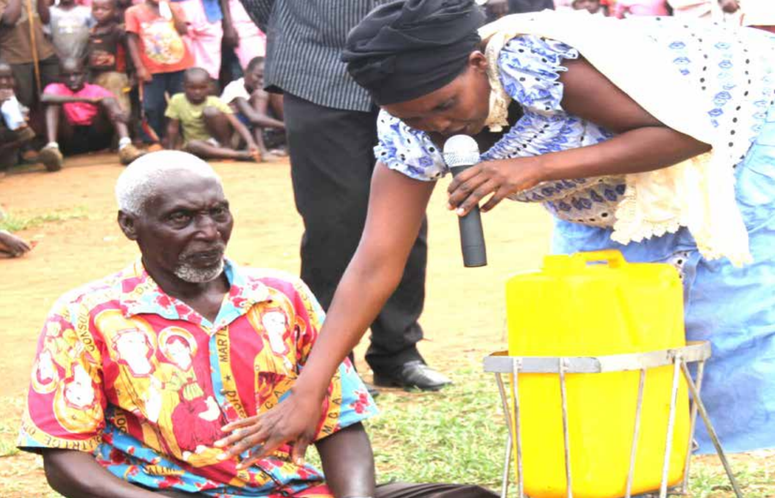
A community facilitator demonstrating to a PWD on the use of a tipping device at a function in Kyangwali.