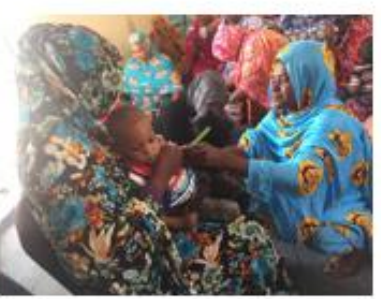
حلقة تطبيقية خلال تكوين للمساعدين الجمعاويين ... النساء تقسن وتأخذن المحيط العضدي لأطفالهن مع شريط مياك