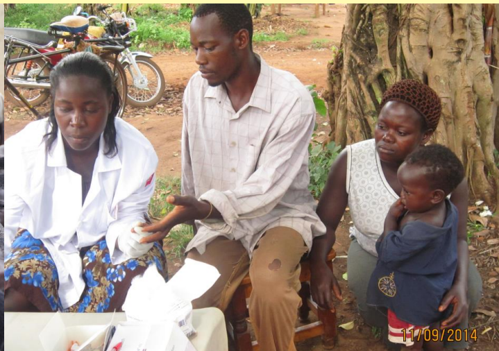
A couple testing for HIV at one of the outreaches in Ngogwe ADP supported by World Vision