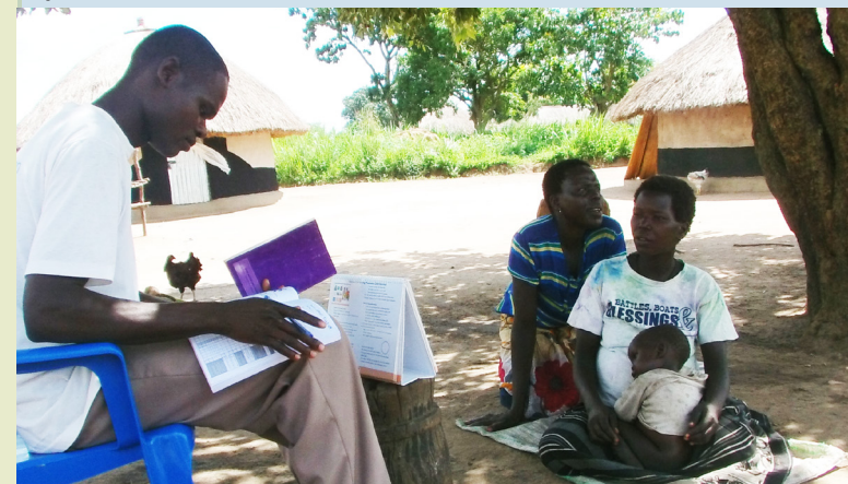
Peer educators preparing a group presentation during a HIV based life skills training in Nabuyoga ADP

ttC is a behavior change model that focuses on building the capacity of village health teams (VHTs) to follow-up pregnant women and mothers of children below two years. VHTs encourage mothers to attend antenatal care, test for HIV, and deliver at the health facility under a skilled birth attendant. They also sensitize communities on HIV prevention, enrolment into care and adherence to treatment for people living with HIV, child survival and malaria prevention.