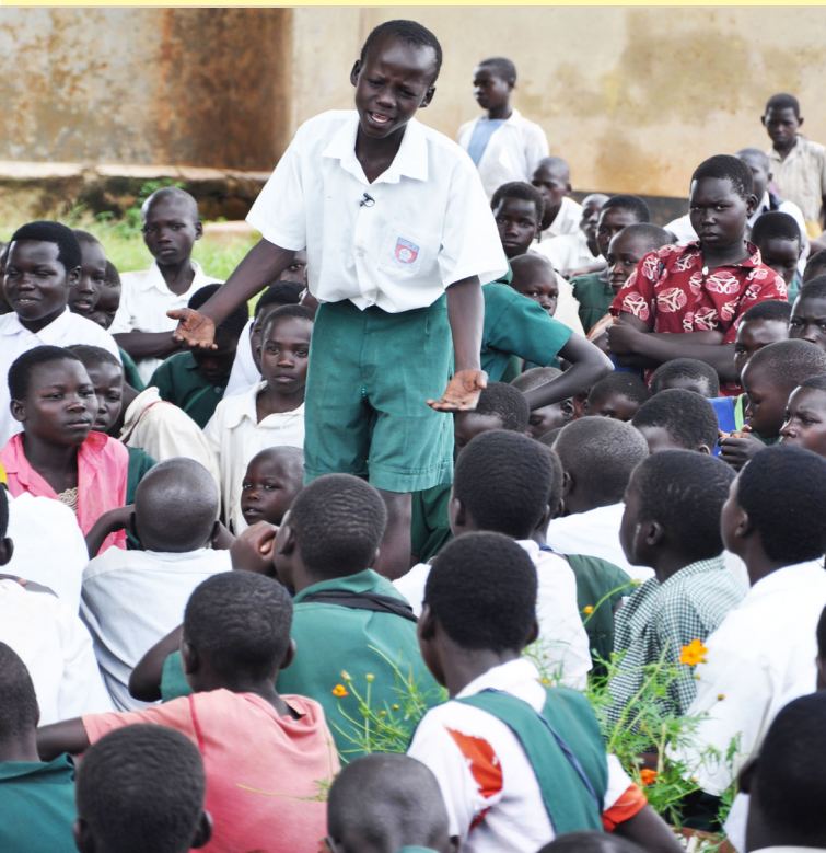
A child peer educator talks about HIV prevention at his school