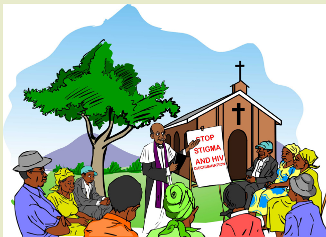
Faith leaders taking lead in one of the CoH training sessions

The model targets faith leaders and builds their capacity to respond to the epidemic by equipping them with basic facts and drivers on HIV. Faith leaders establish teams in their congregation that reach out to families with messages on HIV. They also break stigma and discrimination for those affected by HIV and AIDS.