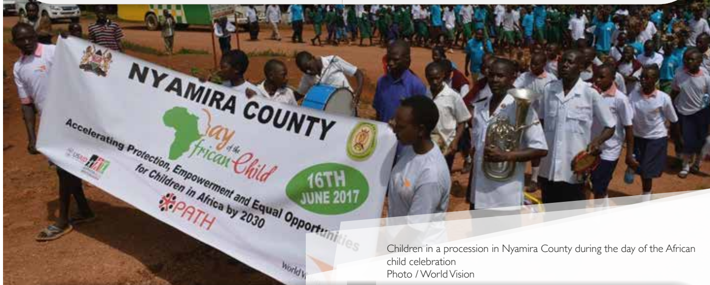
Children in a procession in Nyamira County during the day of the African child celebration