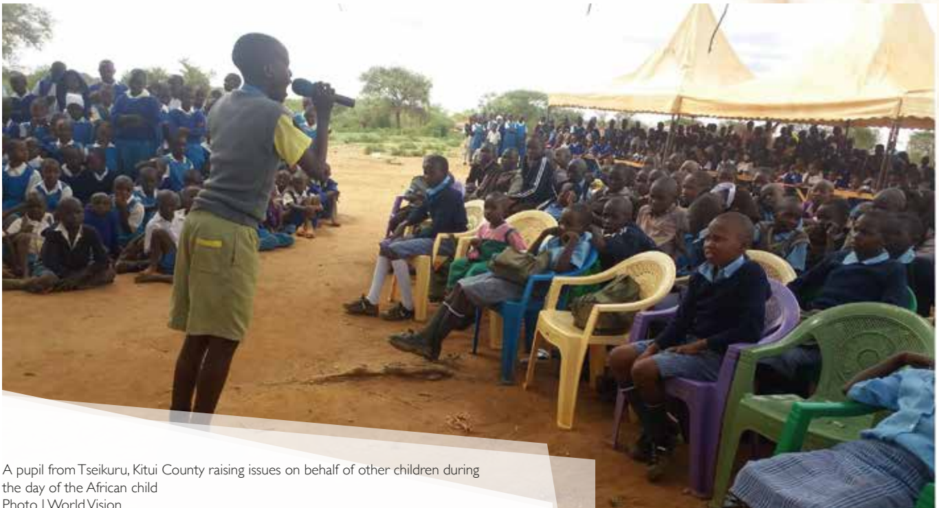
A pupil from Tseikuru, Kitui County raising issues on behalf of other children during the day of the African child