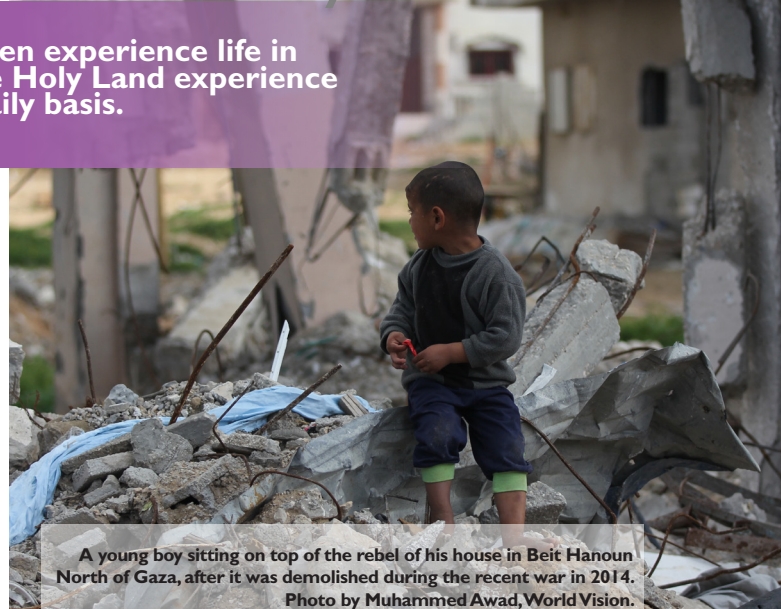
A young boy sitting on top of the rubble of his house in Beit Hanoun North of Gaza, after it was demolished during the recent war in 2014.

We strive to address international engagement- urging a fair-minded approach, grounded in international law and the protection of human rights as well as the safeguarding of the humanitarian space to allow for transformational development.