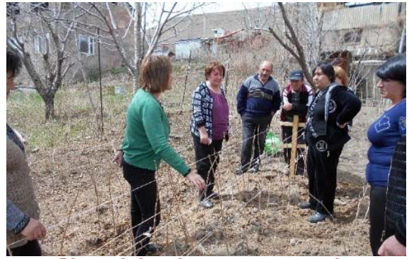
Photo 6: hands-on training on the installation of raspberry pillars and wires