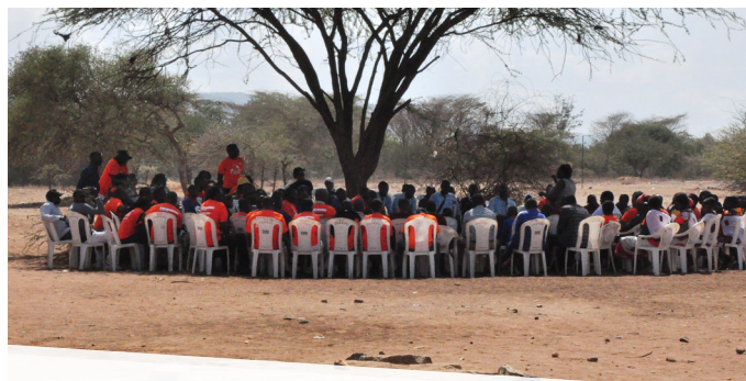
Children from Kuntai Primary School Children, Narok South Sub-County, engaging in a conversation with Government Officials and Non-state actors during the campaign launch programme.

From all the 42 Area Programs where this survey was carried out, Karemo Area program, in Siaya County, recorded the lowest proportion of children responding that their views are being considered during decision making, at 2% while Soin Area Program, in Elgeyo/Marakwet County had the leading proportion at 24.8%. This demonstrates low levels of children participation in decision making, as illustrated in the graph below.