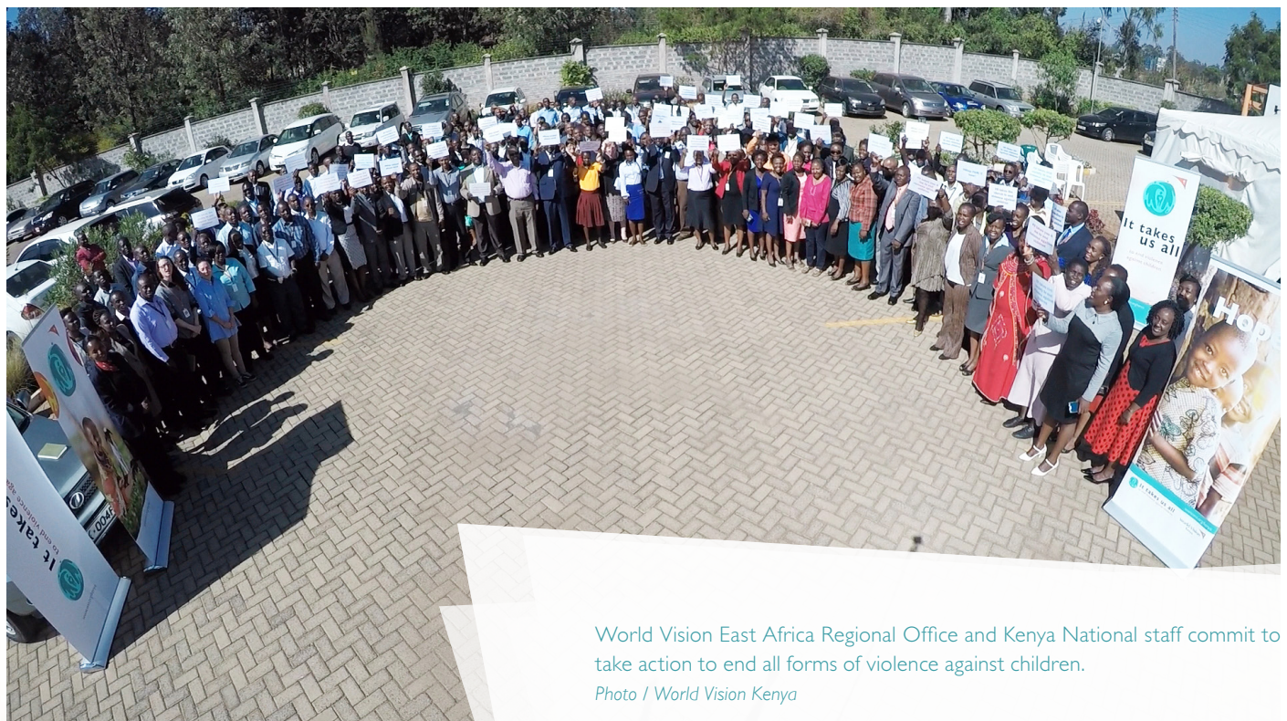
World Vision East Africa Regional Office and Kenya National staff commit to take action to end all forms of violence against children.