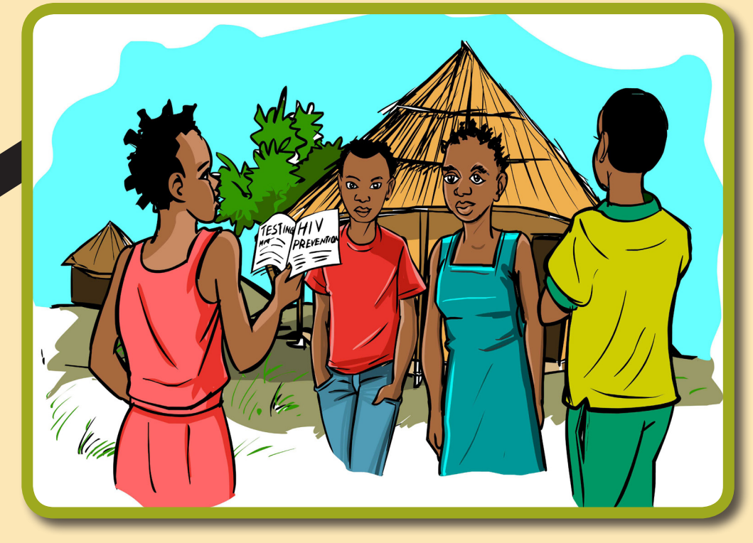
Expanded prevention model – Empowerment of youth

Reduced incidence of HIV among women of reproductive age, exposed children and improved survival of HIV positive mothers and children