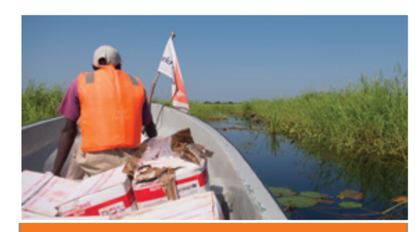
A World Vision boat packed with RUTF traveling on the Nile River to reach a clinic.

Even before the fighting and in areas which are not directly affected by conflict, populations have been mobile.<sup>23</sup> But the onset of conflict has greatly increased people's movement as entire populations