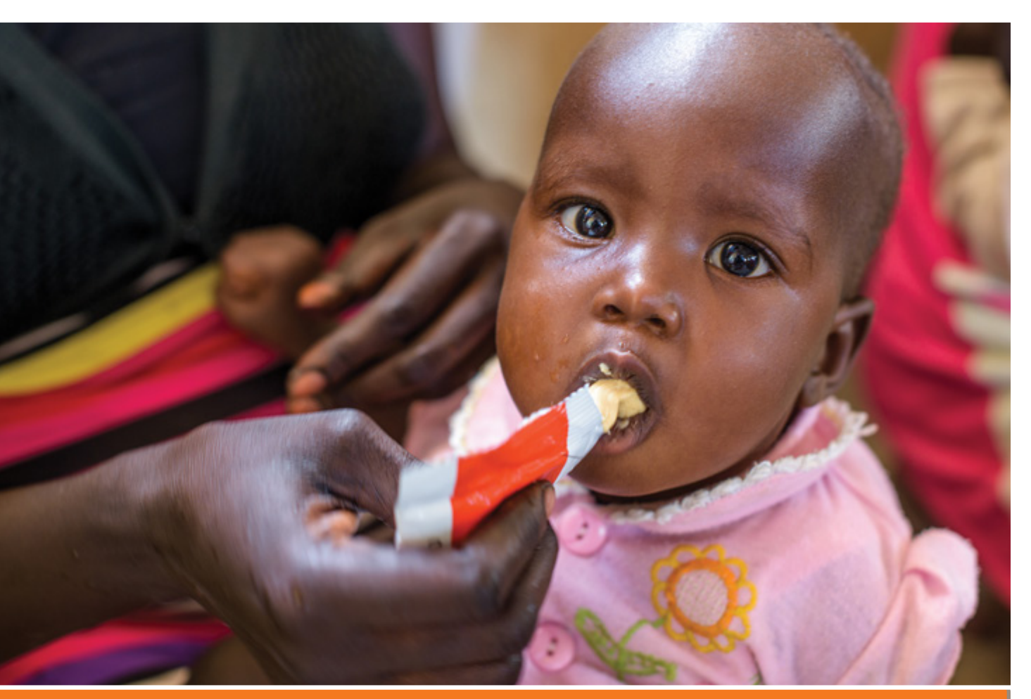
The World Vision nutrition staff monitors weight before distributing appropriate rations of RUTF.

The normal progression of CMAM, which involves transitioning capacity to local actors, may be impossible in situations of ongoing conflict. In the absence of this transition, predictable and long-term funding is essential. Without it, gaps in programme delivery and the loss of expert staff will hamper treatment of acute malnutrition.