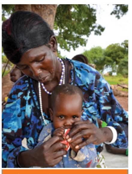
A mother feeds her daughter at an Outpatient Therapeutic Programme centre in Warrap State.

The flexibility and responsiveness that are typical in the earliest phases of a rapid onset emergency response are also crucial in contexts of protracted conflict, with teams empowered to respond to rapidly changing conditions. Nutrition teams on the ground must also have support to design and test new initiatives to overcome challenges. They should also be accountable for capturing and sharing the results and learnings of these initiatives.