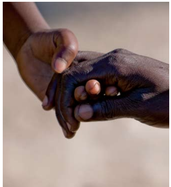
Orphan Enoch with caregiver Roderick. Caregivers provide essential emotional, social and practical support to children and their guardians.

Mirroring the results of 2005, the recent survey found that OVC were much less likely to have their three basic needs met (identified as food, education and shelter). 30 Given the many challenges faced by OVC households, only 28% of OVC had these basic needs fulfilled compared to 51% of non-OVC. The contrast between the two was even starker in the adjacent communities where only 14% of OVC were considered to have adequate food, education and shelter.