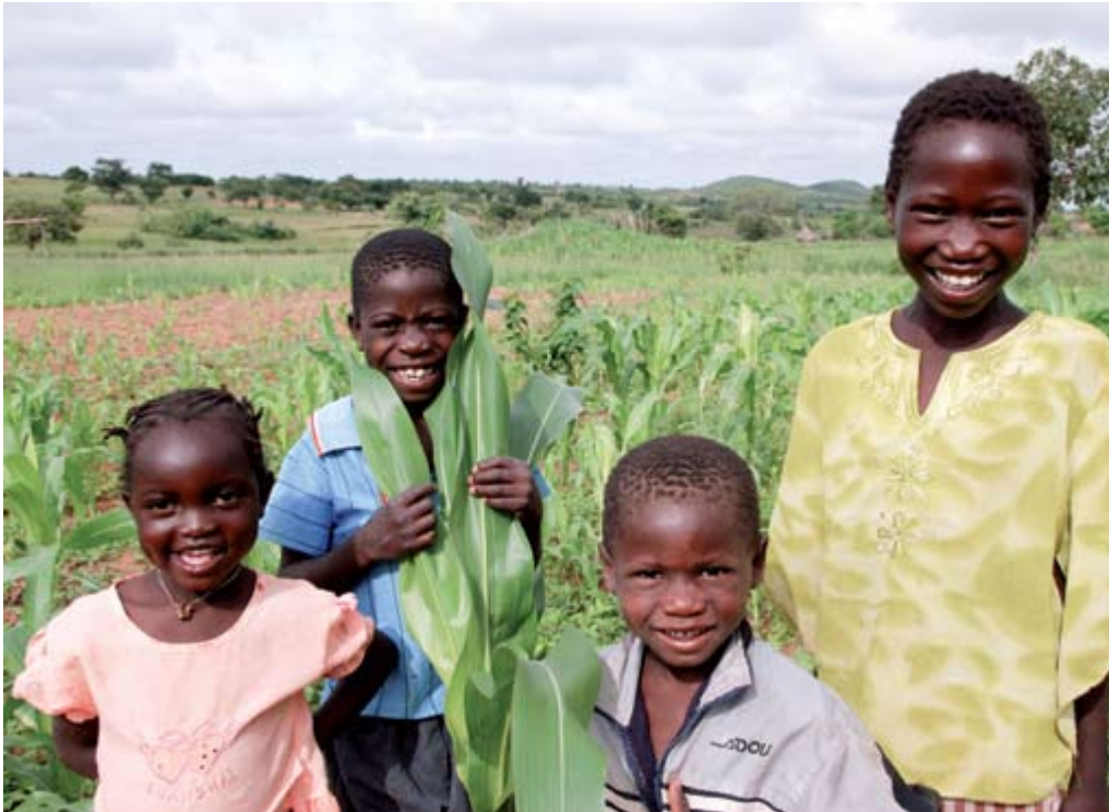
These children in Gwembe District, Zambia are now looked after by their 75 year-old grandmother after they lost both their parents.