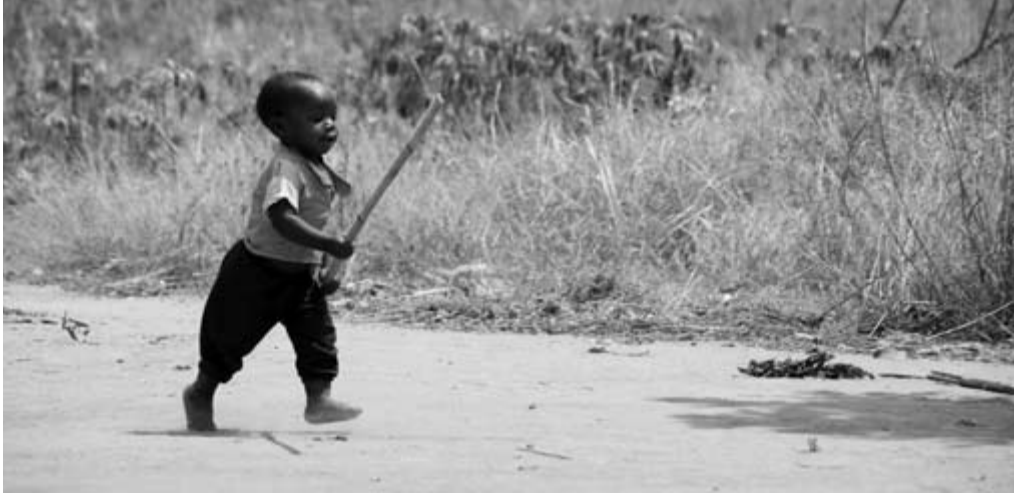
A young child in Mozambique runs with a toy stick.