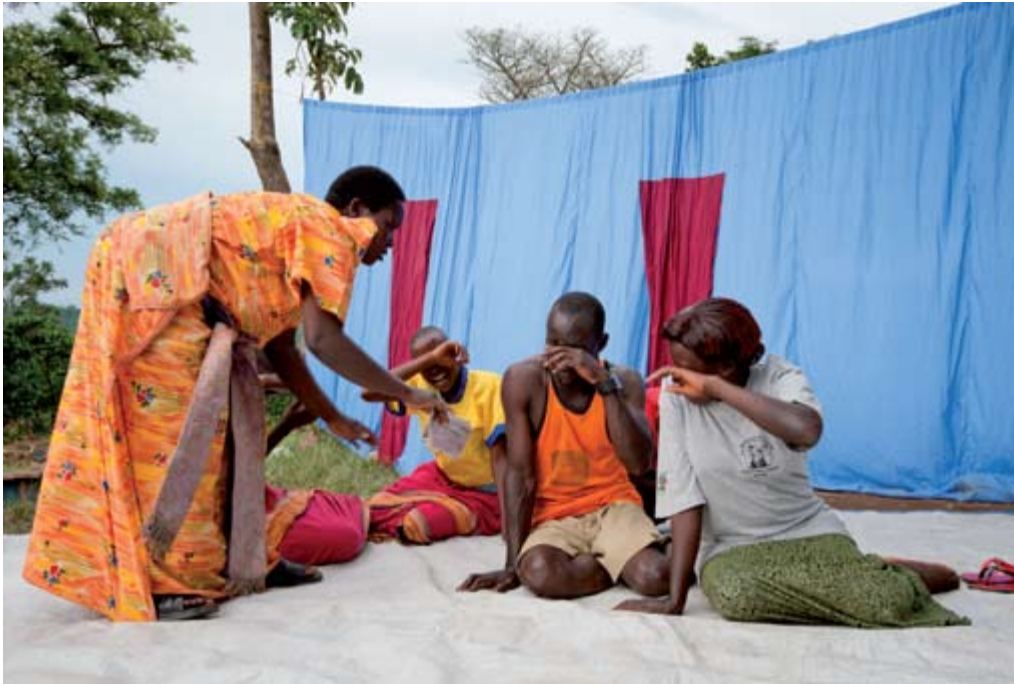
Students at the school in Kasangombe, Uganda, perform AIDS educational dramas.