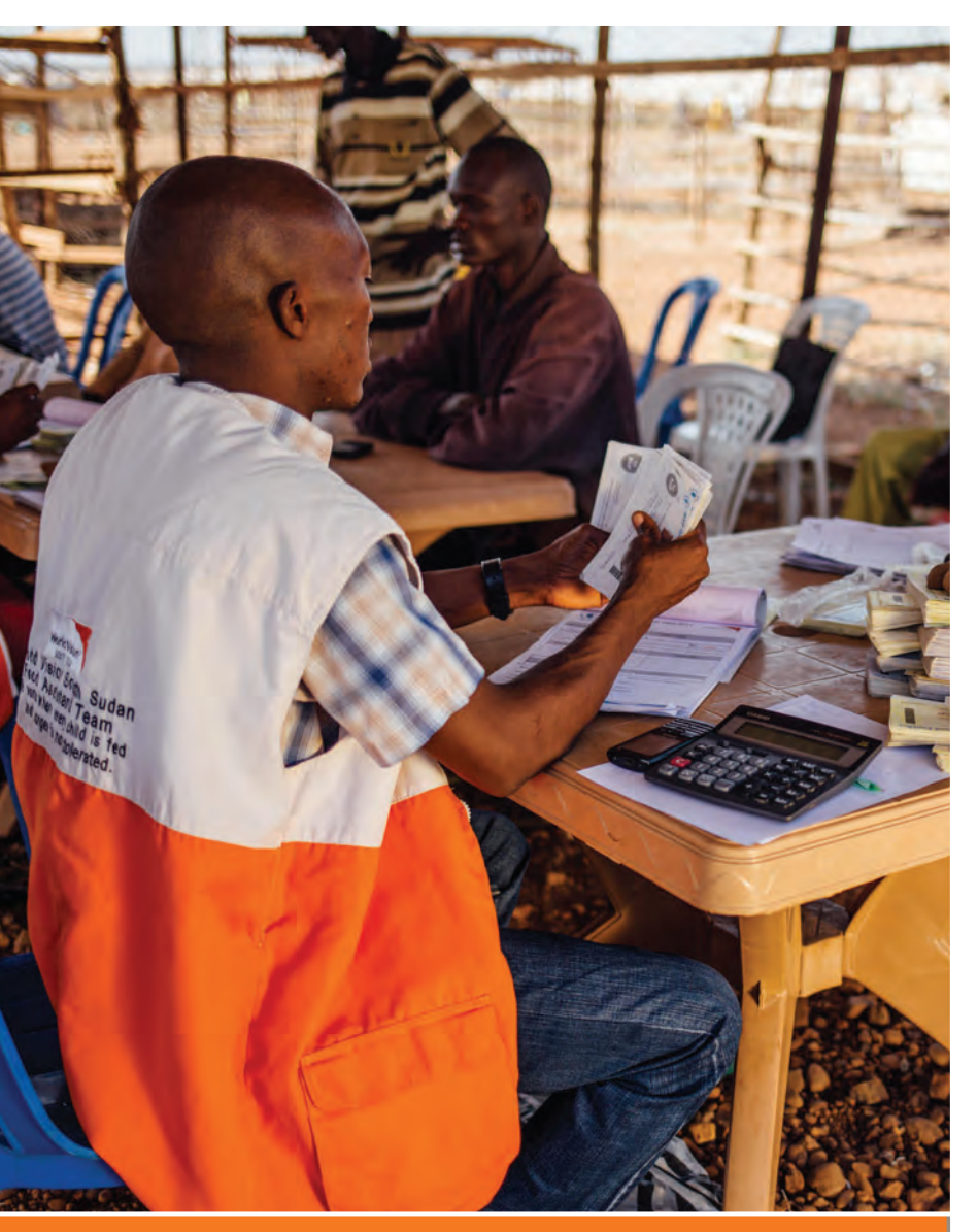
A trader returns vouchers to World Vision for reimbursement.

World Vision is a Christian relief, development and advocacy organisation dedicated to working with children, families and communities to overcome poverty and injustice. Inspired by our Christian values, we are dedicated to working with the world's most vulnerable people. We serve all people regardless of religion, race, ethnicity or gender.