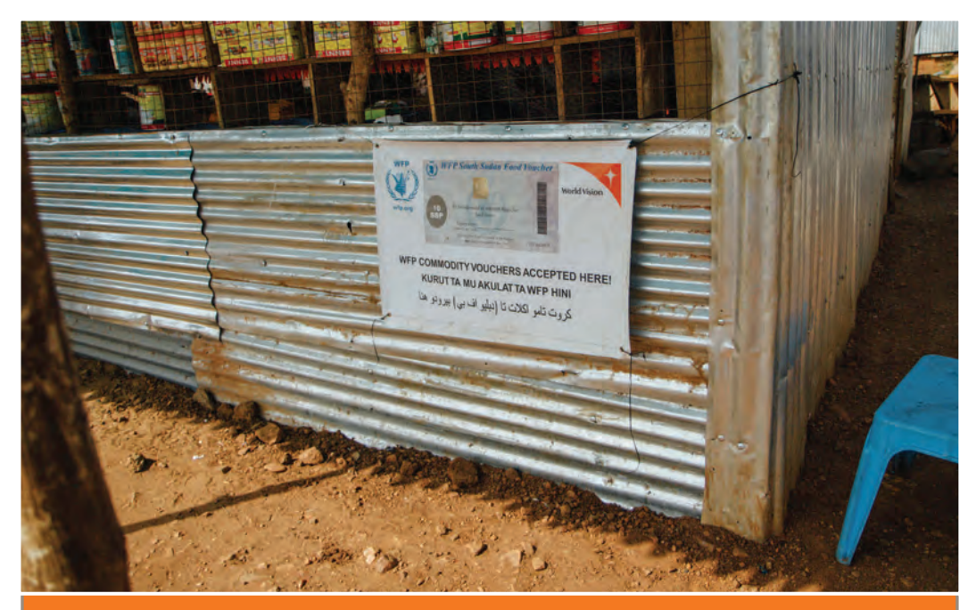
A shop in Juba PoC displays a sign to indicate that it is participating in the voucher programme.

Community leaders have seen the positive impacts of the programme within the PoC.