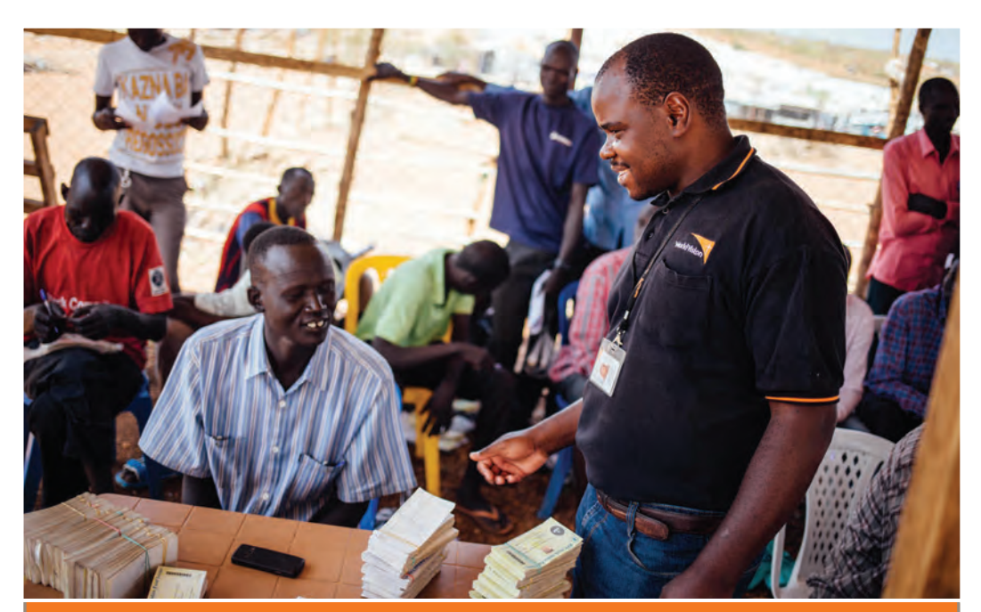
A trader returns vouchers to World Vision for reimbursement.

World Vision is continuing to learn from its experiences in cash-based programming in fragile contexts and to share the growing evidence that cash-based programmes can play an important role in supporting children and affected communities in meeting their needs – even in the most challenging operational environments.