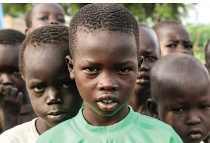
Young children from South Sudan at a refugee transit centre in Uganda.