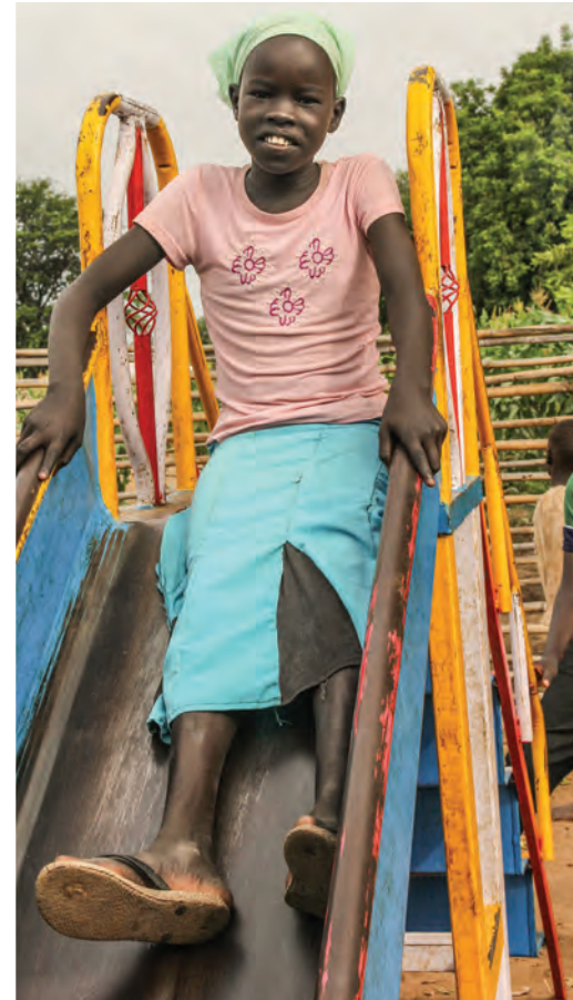
This young girl and her family live in Uganda after fleeing violence in South Sudan.

'World Vision was the first agency to respond in the area of child protection and education. Although initially CFSs focused only on the provision of structured play and recreation, we soon realised that we needed to integrate ECD since there were no schools, especially in new settlements like Nyumanzi and Ayilo. To bring the District on board, World Vision conducted training for district school inspectors, centre coordinating tutors and other agency staff. The setting up of CMCs and caregivers was done in collaboration with us. Since then we work closely with all actors engaged in providing education.' – Adjumani District Inspector of Schools in Charge of ECD