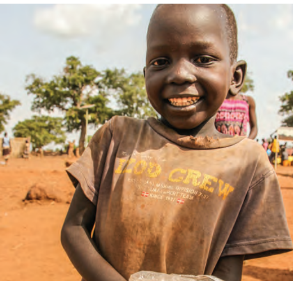
A young boy from South Sudan plays at his new home in Uganda.

'Food is essential to everybody and thus has been used as an important mobilisation tool for child protection. For example, all the 38 Food Management Committees have received training on child protection and have been able to identify and refer vulnerable children, especially child-headed households, and ensure that they receive food. In this way, we have been able to mainstream child protection in food distribution.' – World Vision Staff