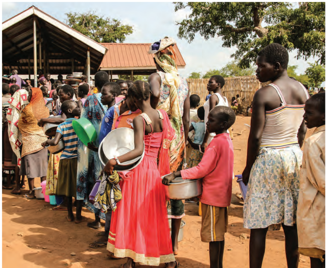
A refugee transit centre in Adjumani, Northern Uganda.

UNICEF Uganda, 'DRC refugee influx to Bundibugyo – Situation Report #3' (30 July 2013).