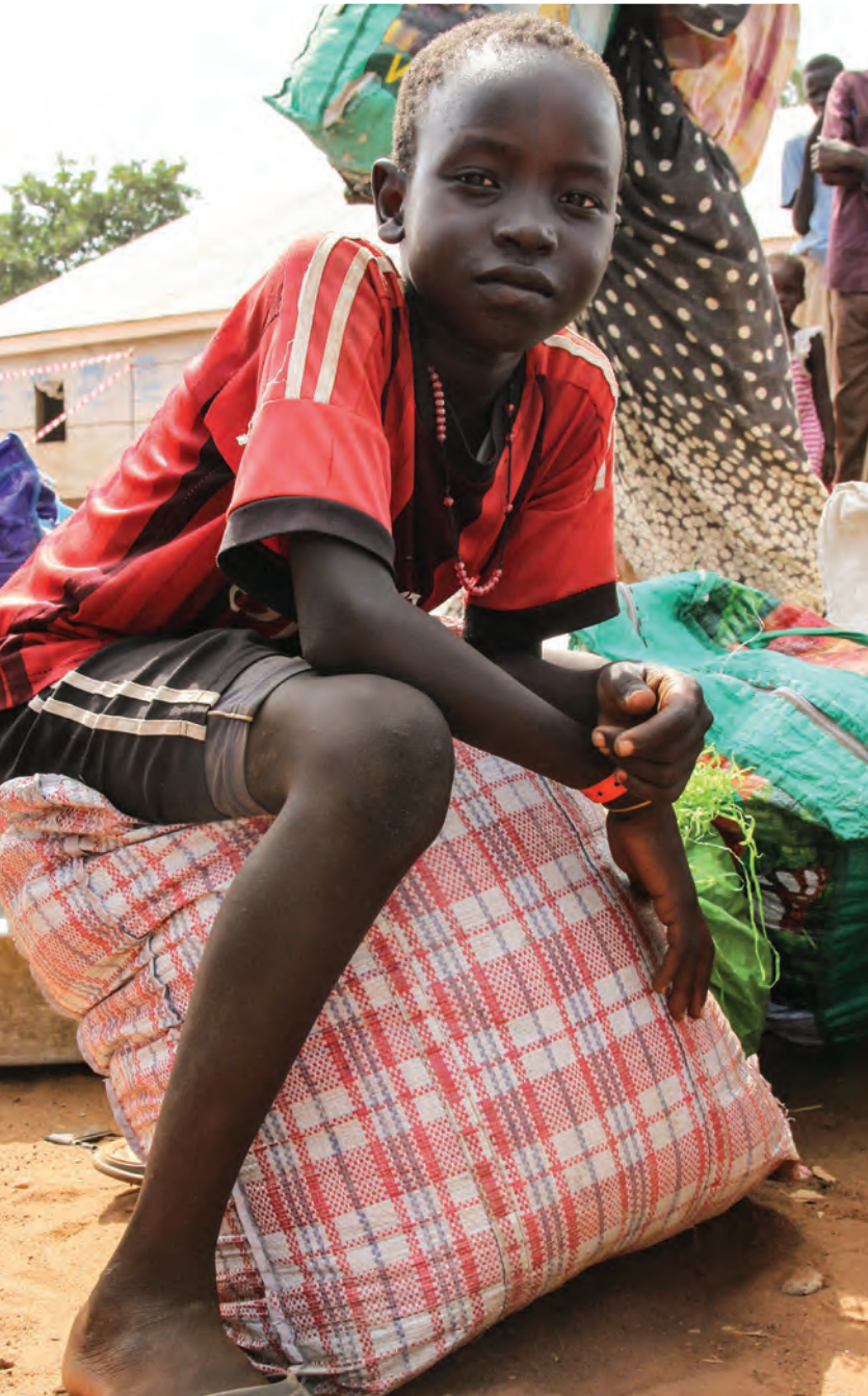
Families from South Sudan arrive at the refugee transit centre in Northern Uganda.

World Vision is a Christian relief, development and advocacy organisation dedicated to working with children, families and communities to overcome poverty and injustice. Inspired by our Christian values, we are dedicated to working with the world's most vulnerable people. We serve all people regardless of religion, race, ethnicity or gender.