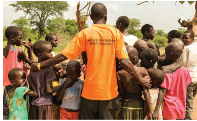
World Vision staff member from South Sudan works in Uganda with refugees from his country.

The CFS activities mainly centred on structured indoor and outdoor play and sports activities allowing them a safe space to play. Other activities at the CFSs included providing basic numeracy and literacy skills, targeting both refugee children and their parents. Children who required further specialised support were identified and referred using a referral