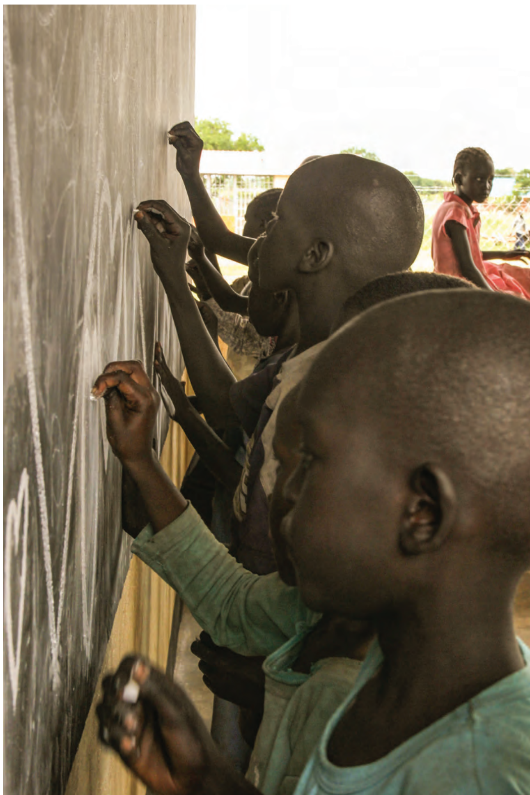
Children in Adjumani, Northern Uganda are having fun at the CFS. They love coming here every day and enjoy speaking to the World Vision staff.