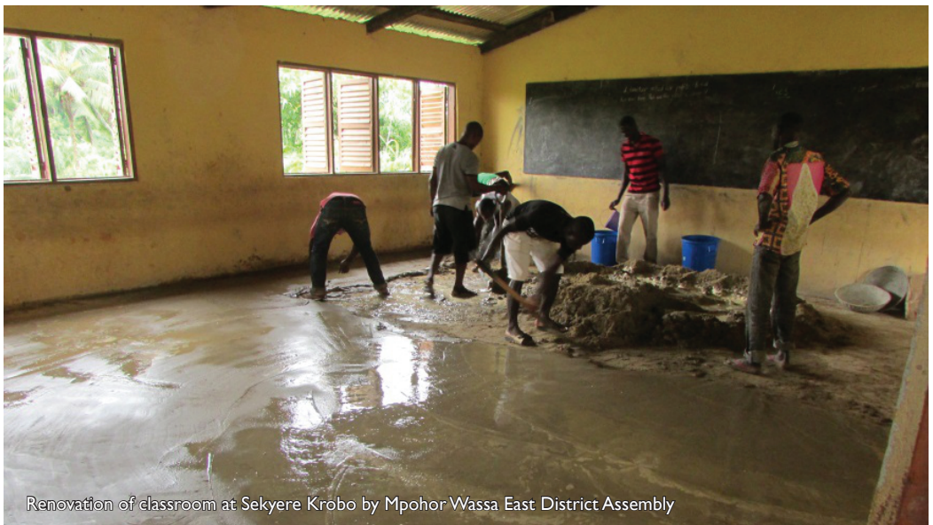
Renovation of classroom at Sekyere Krobo by Mpohor Wasa East District Assembly

Pilot communities have been empowered through training, policy education and facilitation leading to community mobilisation for development through CVA. Communities have taken the responsibility of meeting and dialoguing with decision makers, service providers and power holders for services to be improved.