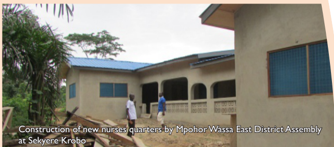
Construction of new nurses quarters by Mpohor Wassa East District Assembly at Sekyere Krobo

Through dialogue with communities, district assemblies made budgetary provision for improvement of education and health services in some communities, for example Sekyere krobo, Gorogo ,Tongo and Datuko communities have addressed water, sanitation, playground ,sports equipment and school infrastructural issues.