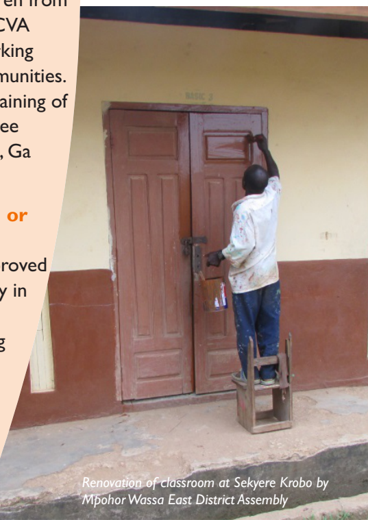
Renovation of classroom at Sekyere Krobo by Mpohor Wassa East District Assembly