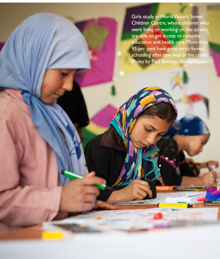
Girls study in World Vision's Street Children Centre, where children who were living or working on the streets are able to get access to remedial education and health care. More than 95 per cent have gone on to formal schooling after one year in the centre.

To improve income levels for rural families, World Vision works through agricultural development initiatives, such as the introduction of drought resistant wheat and pistachio crops, the cultivation soybeans as well as beekeeping and honey-making. As a result, 52.5 per cent of involved parents said their income had increase as a result of beekeeping; 63 percent reported they are now able to cover all the educational costs for school-aged children and 97.5 per cent were able to cover health costs for themselves and their children without assistance, thanks to increased income from the sale of honey.