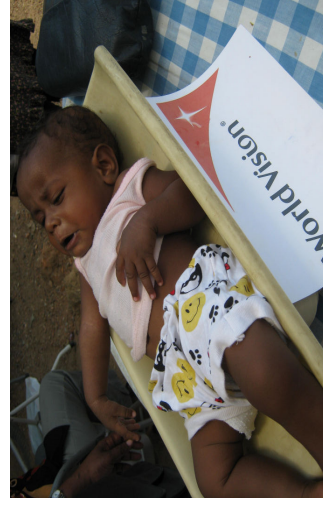
Child being weighed.

In 2012, our two comprehensive MHCN projects will commence in South Malaita and Makira-Ulawa utilising World Vision International's proven 7-11 methodology to strengthen village health worker networks and access to health services.