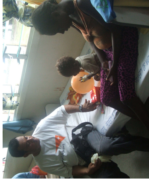
World Vision staff member talking to a sick child.