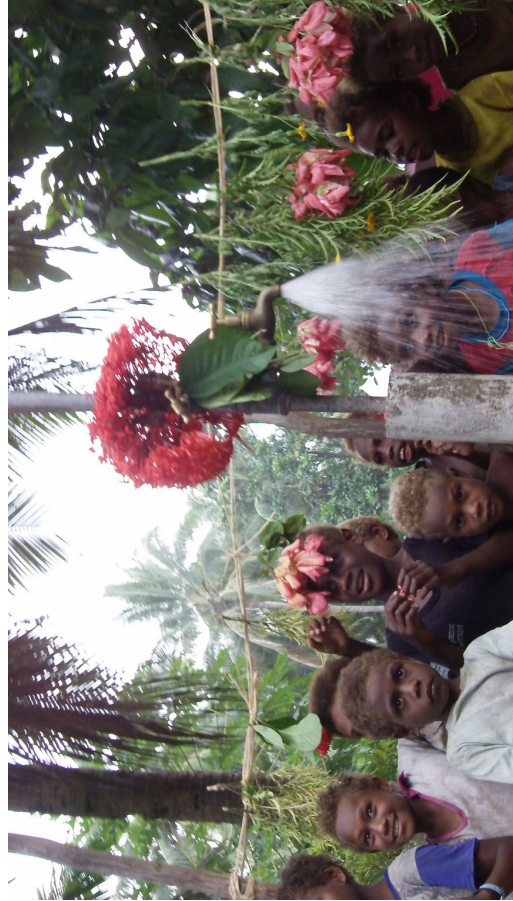
Children from Weathercoast looking on at their new water system.

“As Christians, we enable vulnerable South Pacific communities, in particular their children, to be owners of lasting change, overcoming physical, social and spiritual poverty.”