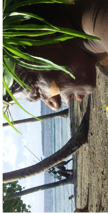
Warriors in Makira-Ulawa.

Two Community Based Disaster Risk Reduction projects also began in Temotu and South Malaita. These projects focus on building community capacity to mitigate disasters, like cyclones with storm surges.