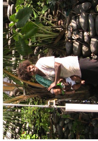
Woman bathing her baby on the Weathercoast.

More than 2,000 people now have access to fresh water and sanitation systems in the Weathercoast due to this project. Our WASH team built rain catchment tanks, water systems and toilets and provided hygiene training.