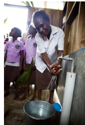
A school student from Wanderer Bay Community High school demonstrates washing hand.

This one year project aims to deliver clean water and sanitation along with improved hygiene behavior to 25 communities in Santa Cruz Island affected by the 2013 earthquake and tsunami. The focus of the project is on providing communities with infrastructure and training on water system management. The project also aims to encourage changed behaviour to improve sanitation and hygiene using the Community Led Total Sanitation (CLTS) methodology. This will be the second project using the CLTS methodology and continues WVSI and UNICEF's commitment to bringing CLTS to the Solomon Islands. This project started in June 2013 and is funded by the European Union, UNICEF and World Vision Australia.