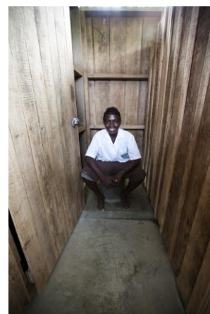
A school student demonstrates proper sanitation