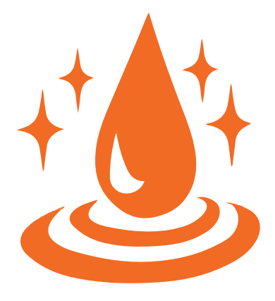
Reduce incidence of selected Water, Sanitation and Hygiene (WASH) related diseases/illnesses linked to undernutrition