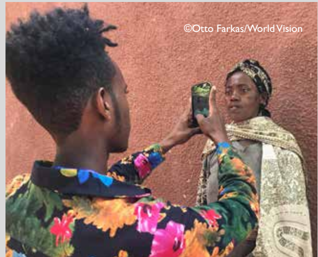
Cash distribution conducted by World Vision/CCD Ethiopia.