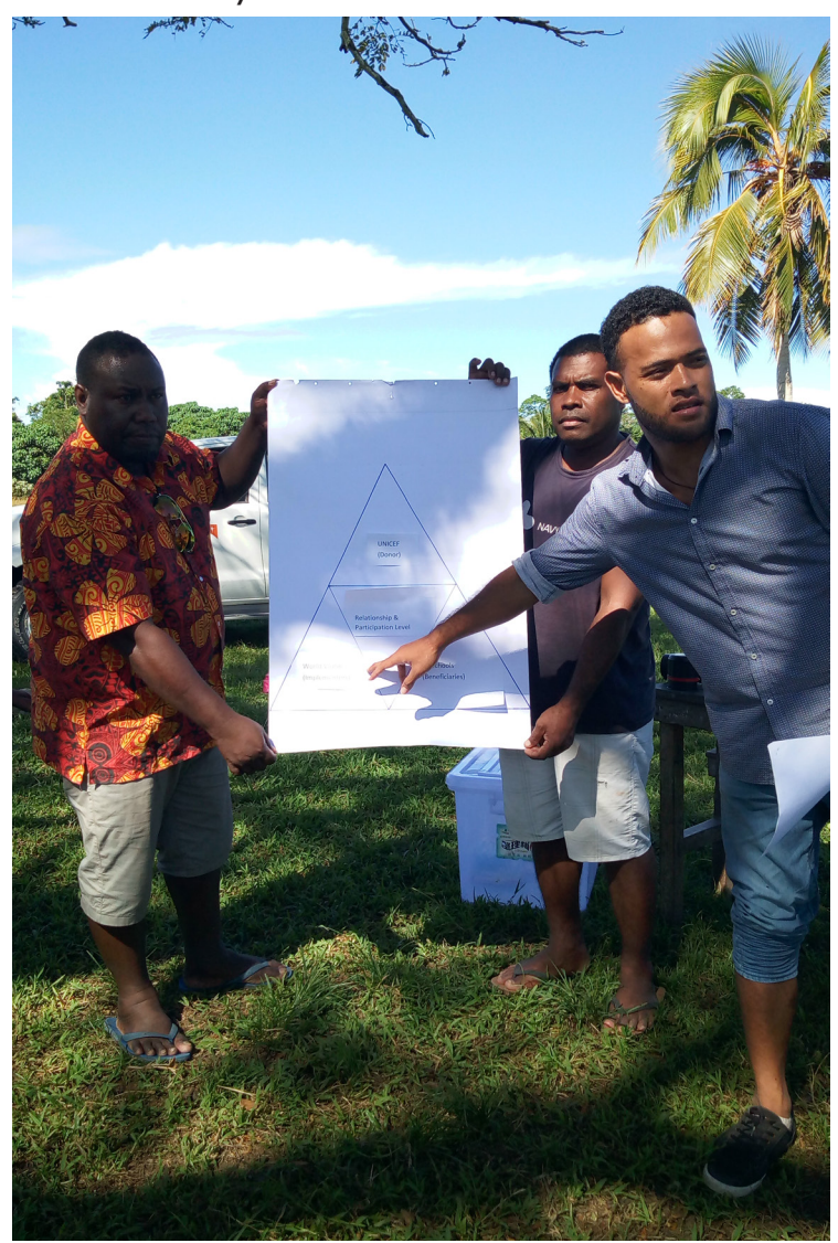
SIBLE team members demonstrating the projects partnership structure to community members.

The project will establish and train school committees and teachers on WASH and solar powered facilities in the communities. Student WASH clubs and activities will be established and School WASH facilities will be upgraded to be girl-friendly (can be easily accessed by girls) at the target primary schools and attached ECE centres. Staff WASH facilities will also be upgraded or constructed where necessary.