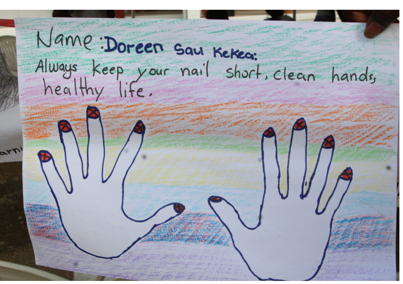
'Clean hands, Healthy lives.' An artwork by a student from Tenavatu primary school during the international global hand washing day event.

Rate CHS/Primary School, Tamurora Primary, Gifu Primary, Mbalasuna Primary, Nguvia CHS/Primary, Anva Primary, Belaha CHS/Primary, Tenavatu Primary, Ruvuvatu Primary, Ruvuvatu Secondary, Gilo Primary, Reko Primary, Ghaobata CHS/Primary, Vanua Levu Primary and Tetupa Primary.