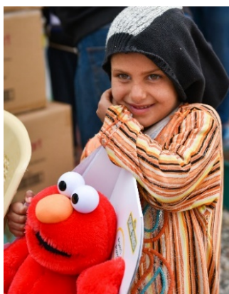
There are 6.7 million people in need in Iraq, half of whom (3.3 million) are children.

This validates the pressing need to reduce financial access barriers by developing meaningful programming with smart use of CVA in order to overcome issues of chronic shortages, appropriate accommodations in protracted crises for displaced children and their caregivers, and access to food and mitigate the risk of child labour.