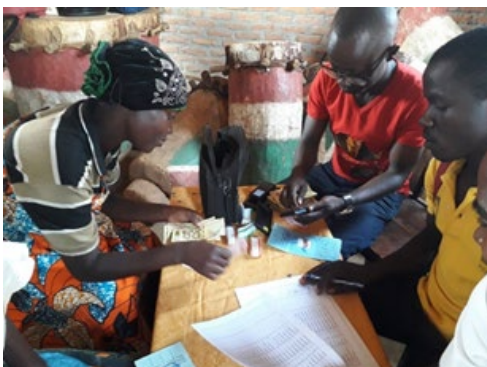
Community member from Buga in Burundi is counting cash after money withdrawal