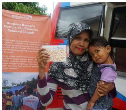
MPCA beneficiaries from Central Sulawesi, Indonesia

World Vision has supported more than 1.4 million most vulnerable children and over 3 million people through CVA-enabled programmes in natural and conflict-related disasters in the 2018 fiscal year. Children and adolescents are among the most vulnerable affected populations as the Venezuela crisis response presentation showcased. 1