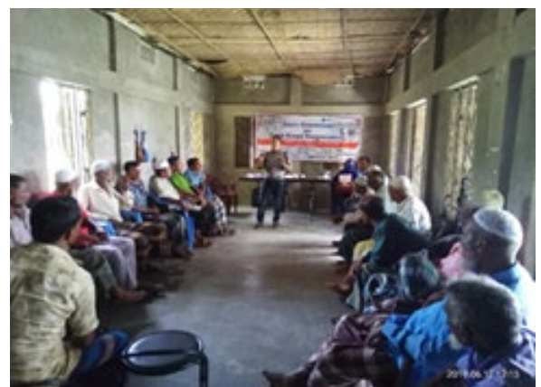
CVA training session for 60 staff and community members in preparation for flood response in Bangladesh