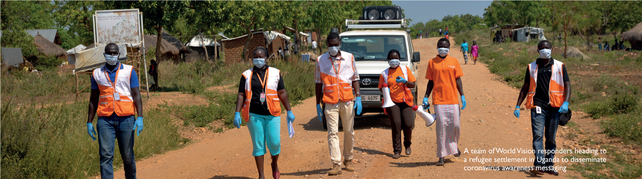
A team of World Vision responders heading to a refugee settlement in Uganda to disseminate coronavirus awareness messaging