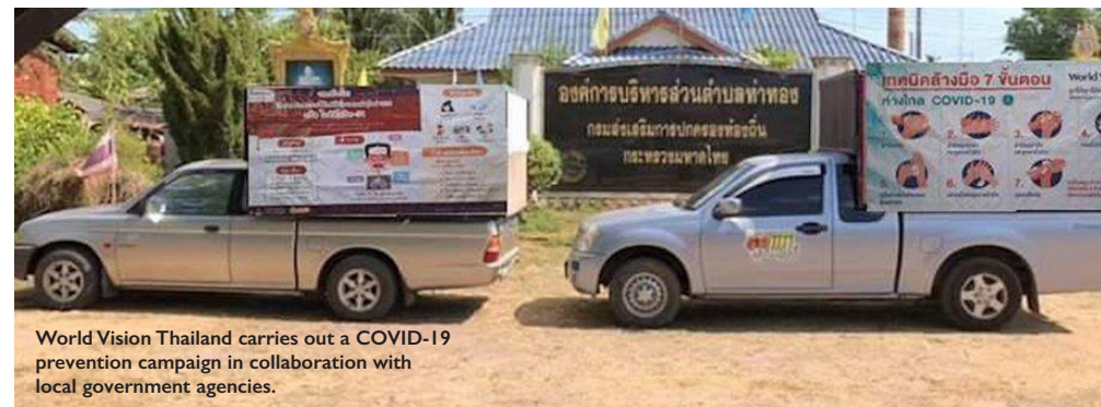
World Vision Thailand carries out a COVID-19 prevention campaign in collaboration with local government agencies.