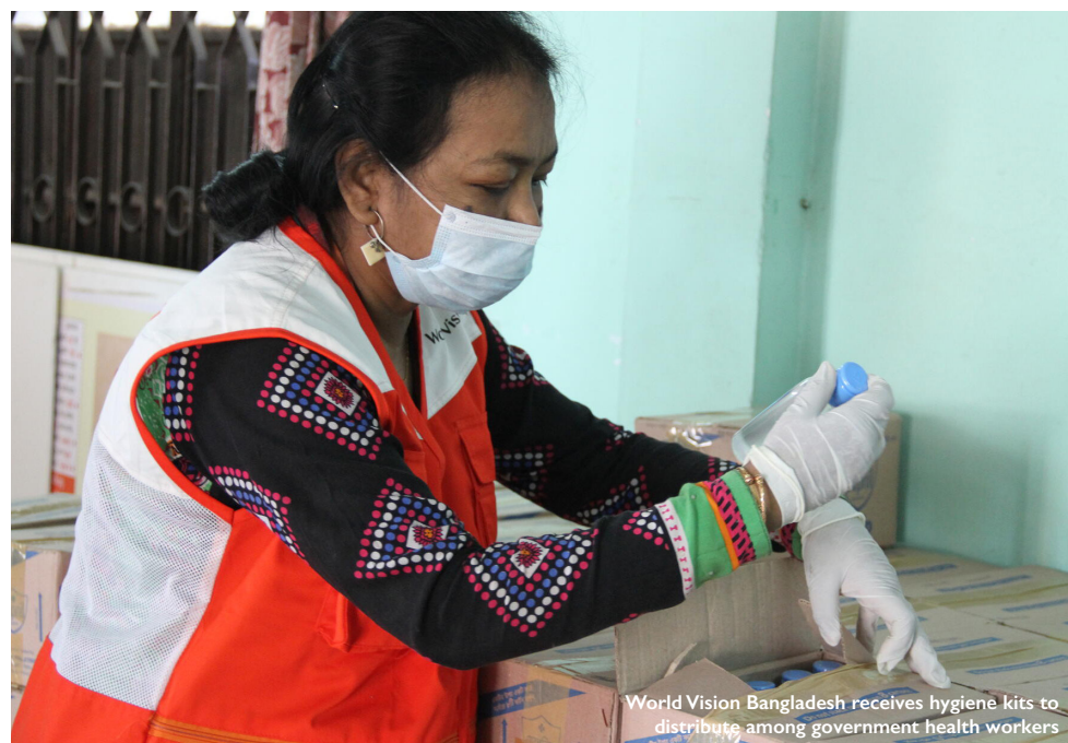
World Vision Bangladesh receives hygiene kits to distribute among government health workers