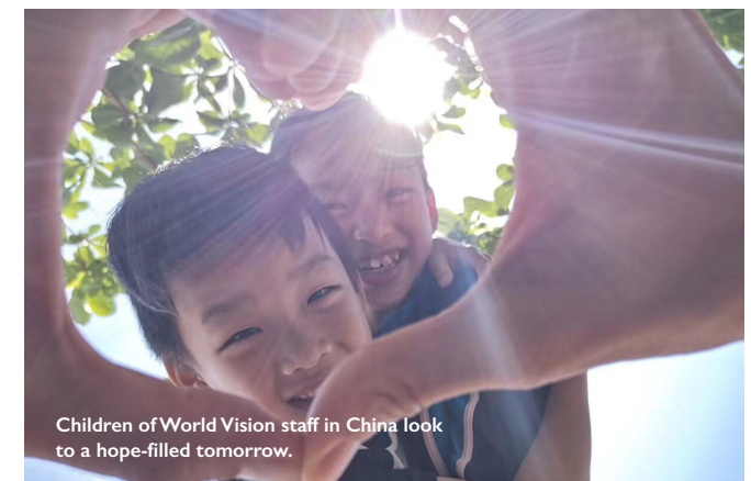
Children of World Vision staff in China look to a hope-filled tomorrow.

**No data for these countries on WHO SitReps