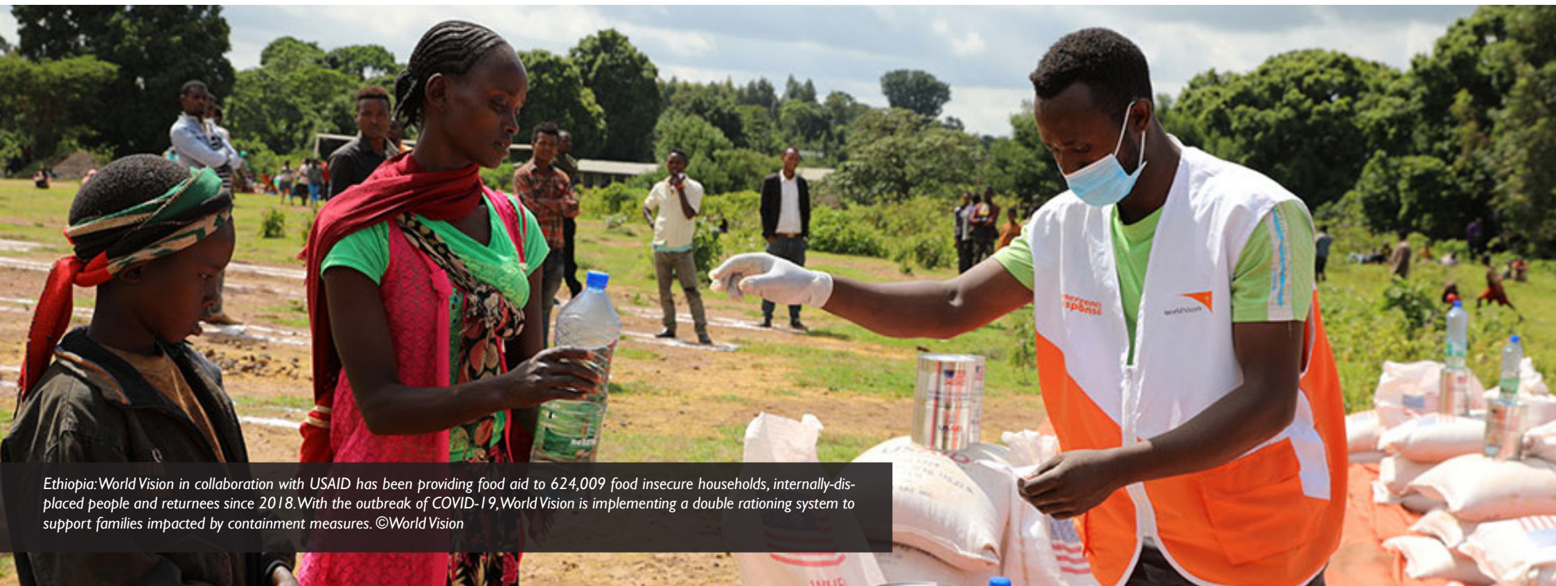
Ethiopia: World Vision in collaboration with USAID has been providing food aid to 624,009 food insecure households, internally-displaced people and returnees since 2018. With the outbreak of COVID-19, World Vision is implementing a double rationing system to support families impacted by containment measures.