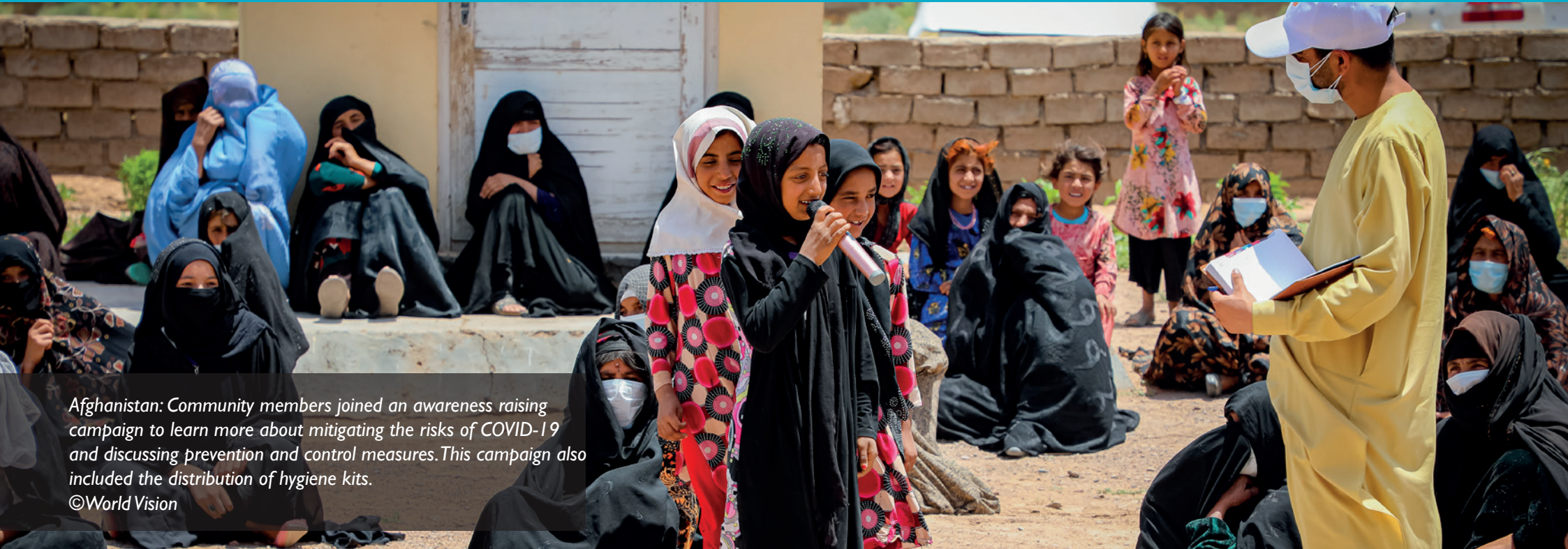
Afghanistan: Community members joined an awareness raising campaign to learn more about mitigating the risks of COVID-19 and discussing prevention and control measures. This campaign also included the distribution of hygiene kits.