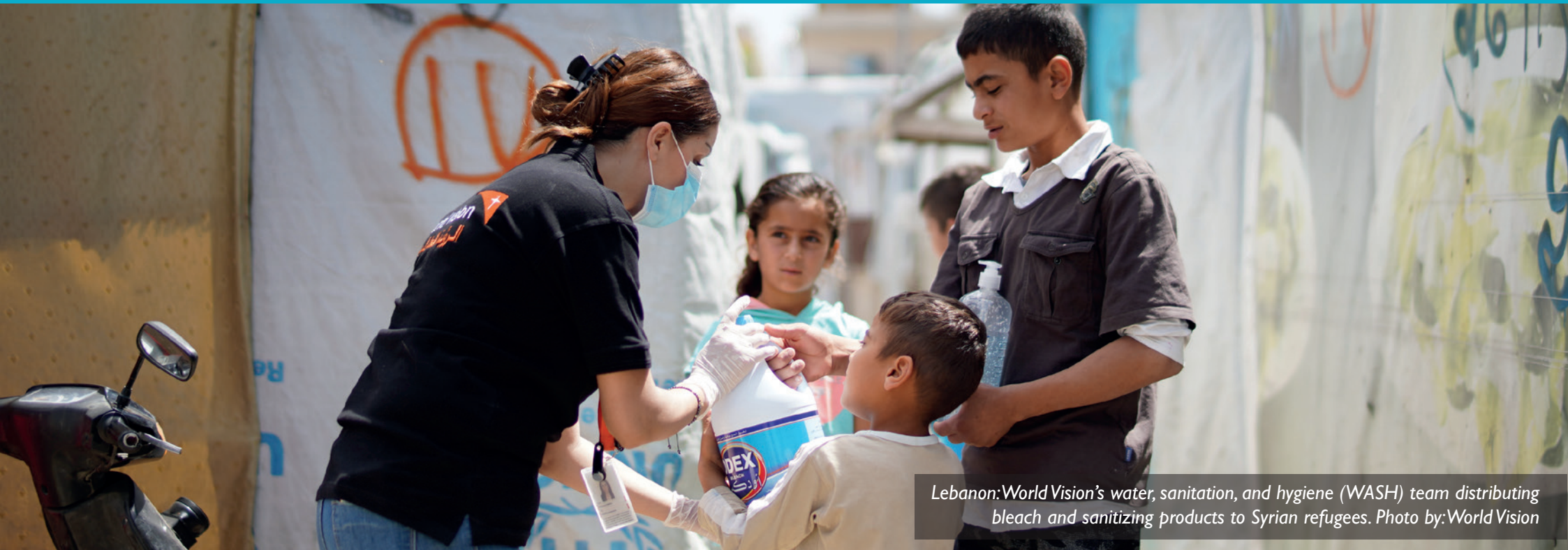
Lebanon: World Vision's water, sanitation, and hygiene (WASH) team distributing bleach and sanitizing products to Syrian refugees.

We would like to thank our generous donors, partners, and supporters including: