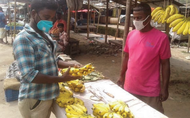
Cash support helps vulnerable families to restore livelihood.