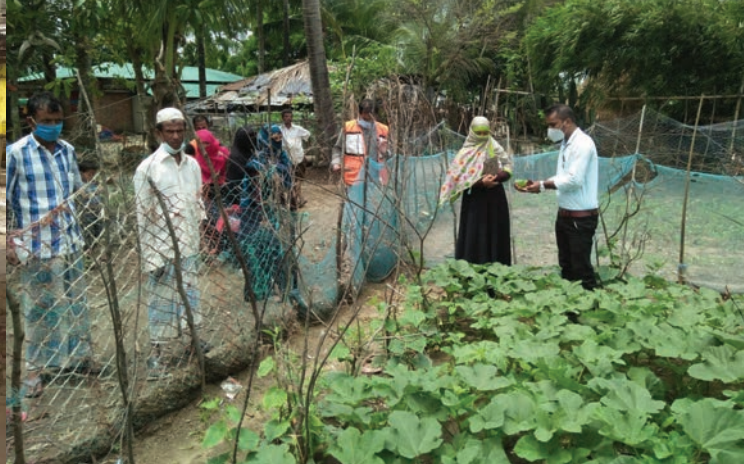
Hands-on training on homestead gardening with summer vegetables seeds provided.