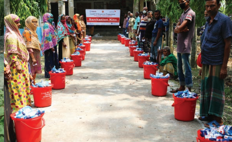
Affected households (HHs) receive sanitation kits.