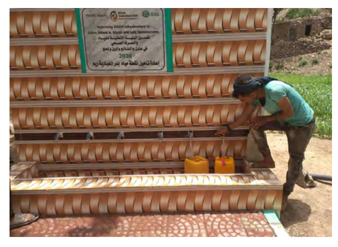
Completed waterpoint in Lahi, 2020 (ADRA)