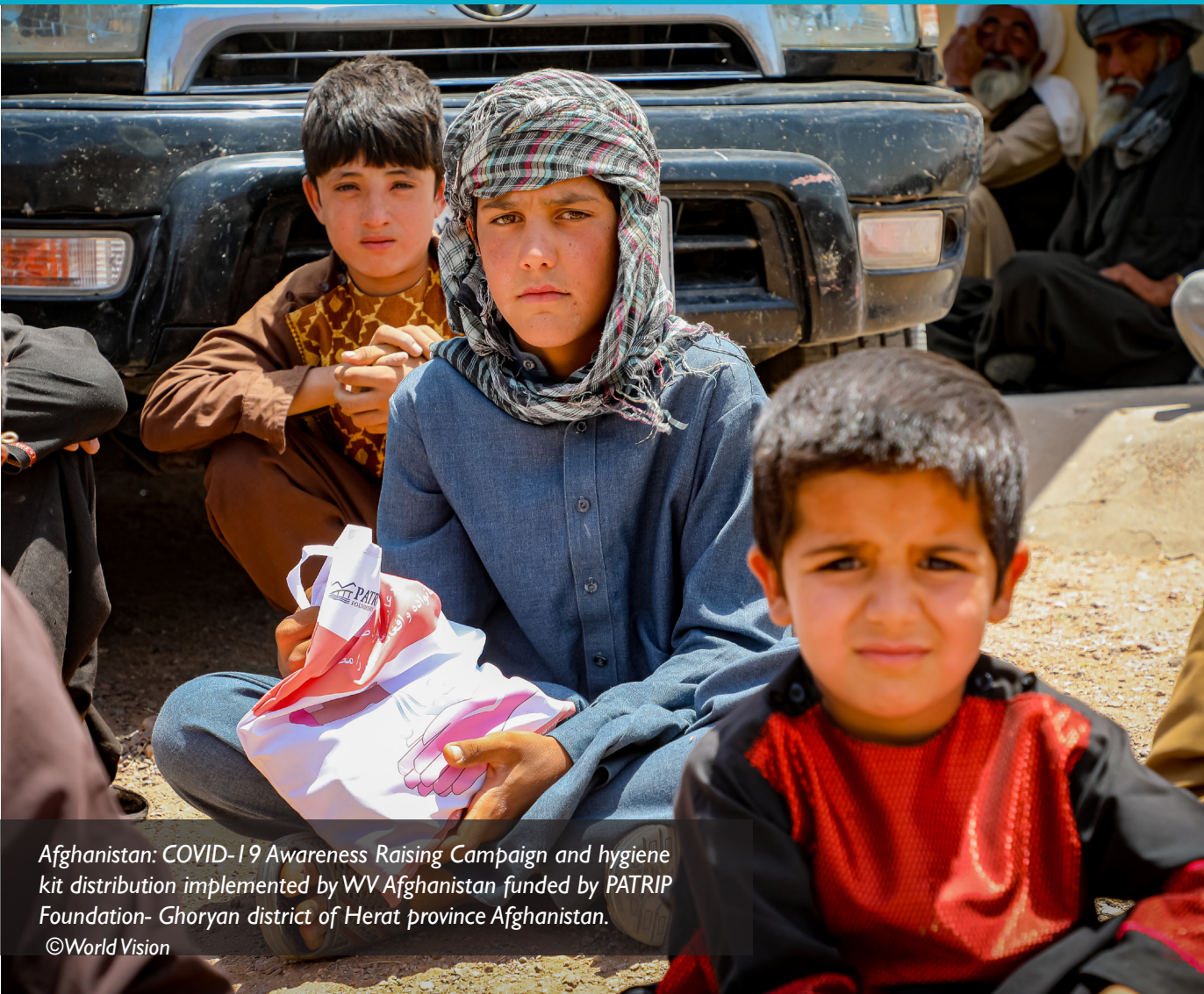
Afghanistan: COVID-19 Awareness Raising Campaign and hygiene kit distribution implemented by WV Afghanistan funded by PATRIP Foundation- Ghoryan district of Herat province Afghanistan.