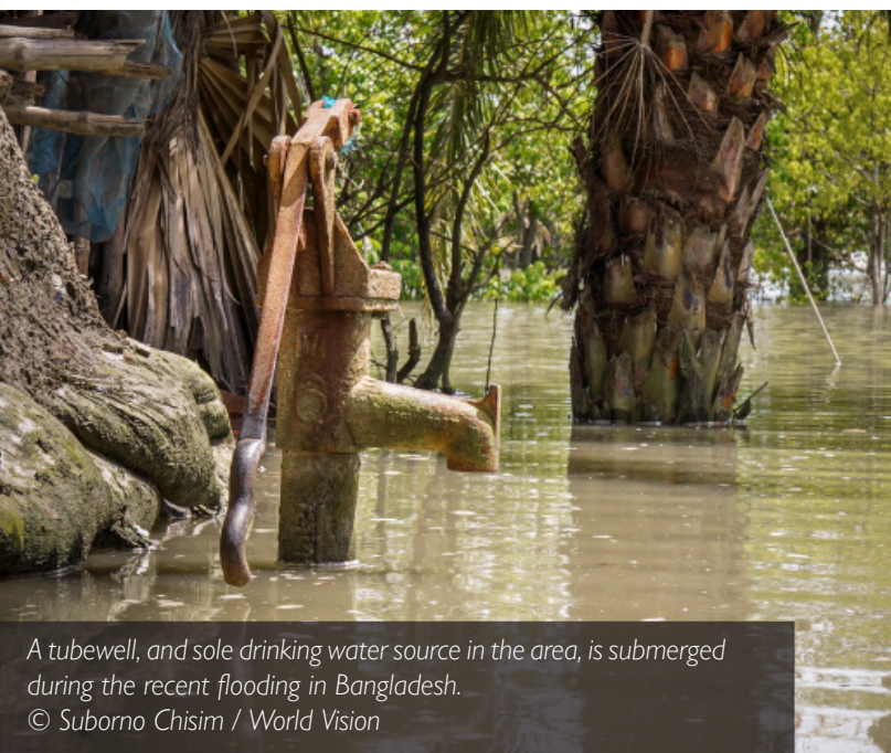
A tubewell, and sole drinking water source in the area, is submerged during the recent flooding in Bangladesh.