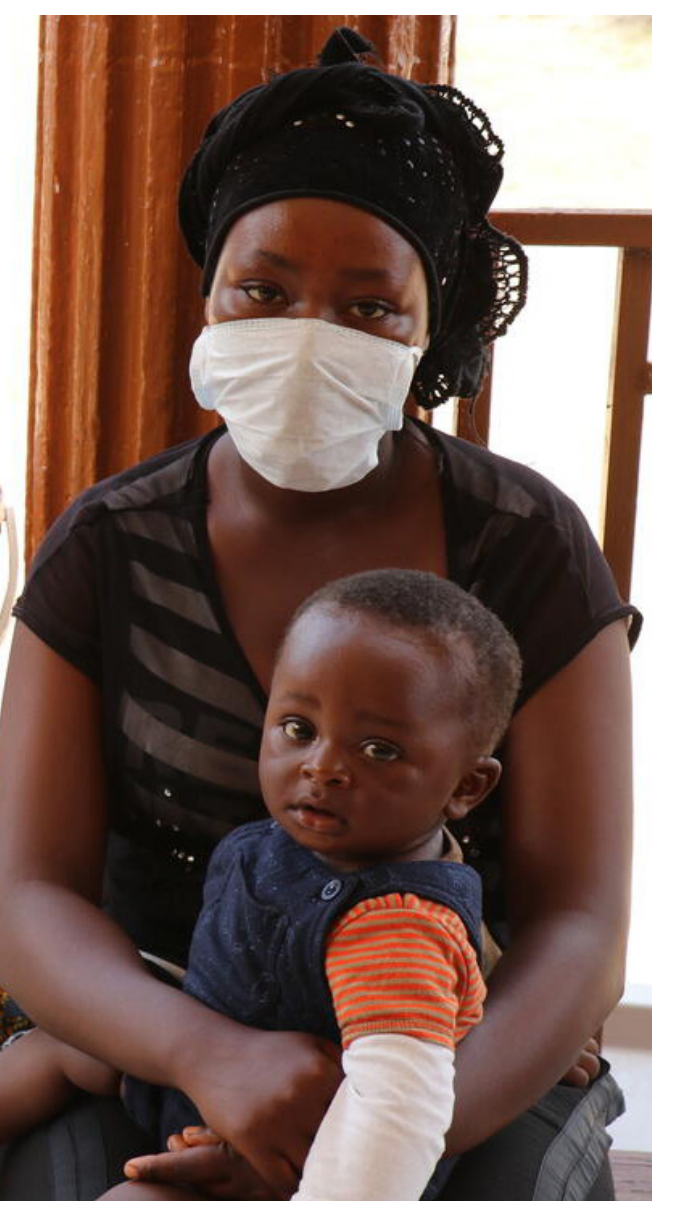
World Vision continues to support health centres in Sierra Leone with COVID-19 prevention materials.