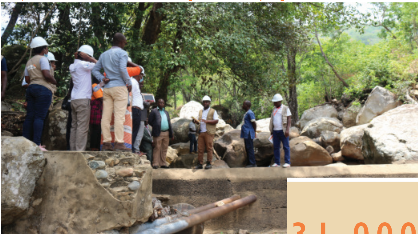
Stakeholders touring the water source

orld Vision Malawi (WVM) says it is geared to provide clean and potable water to communities in order to promote the healthy wellbeing of people especially children in the country.