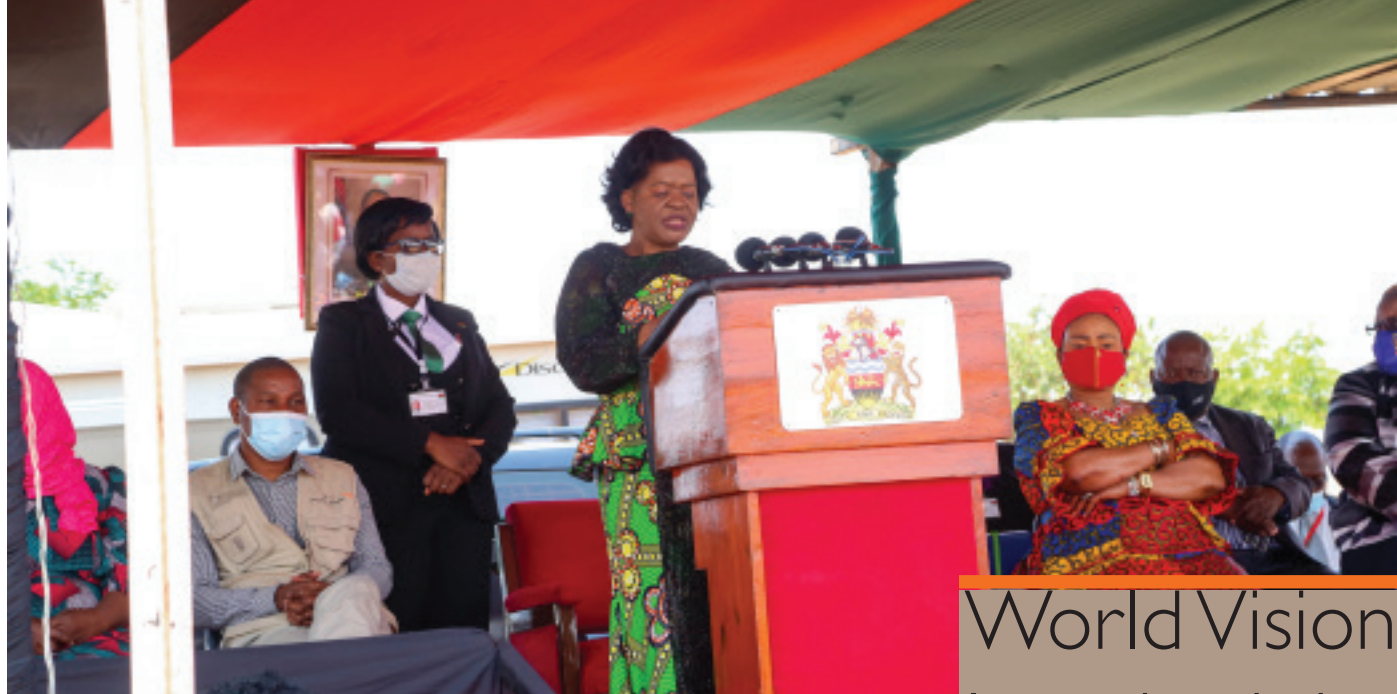
First Lady addressing the gathering