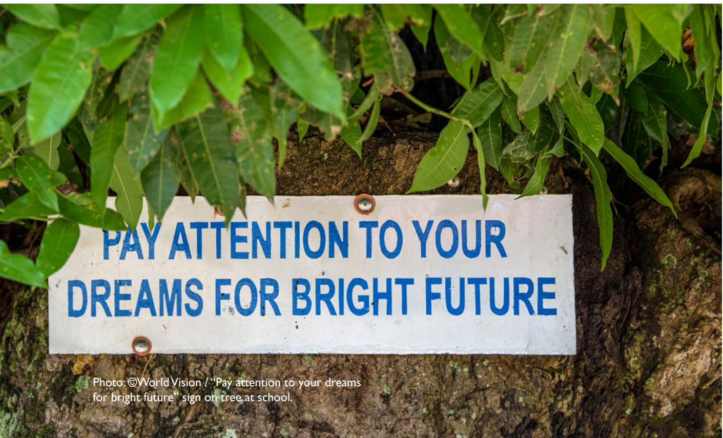
"Pay attention to your dreams for bright future" sign on tree at school.

Designing or adapting existing intervention models to reduce crisis-induced risks and ensure service provision continues, strengthens the impact of response and ensures continuity of existing efforts. For example, in Bangladesh, the COVID-19 response included activities aimed to prevent child marriage through livelihoods support, continued awareness-raising and ensuring access to services. The activities were adapted to the context of the pandemic by using digital means of communication and capacity building. In Afghanistan and Uganda faith and community leaders integrated efforts to prevent child marriage in their activities to prevent the spread of the COVID-19 virus and to assist vulnerable children. In all cases, this approach was critical to ensure continuity of interventions to end child marriage and preserve achieved results.