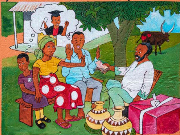
Billboard warning about child marriage in Nakasongola, Uganda.

My child's future is valuable so I say No to Child Marriage