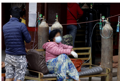
A COVID-19 patient being supplied with oxygen at a hospital amid the COVID-19 lockdown implemented in Kathmandu by the Government of Nepal since April 29, 2021.