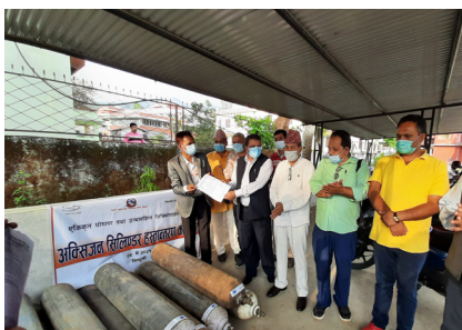
14 Oxygen cylinders being handed over to the District Disaster Management Committee, Sindhuli on 9 May 2021.