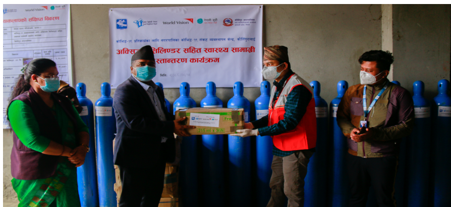
A World Vision staff delivers 25 oxygen cylinders, 15 pulse oximeters, 15 IR thermometers and 12 PPE to the COVID-19 Crisis Management Center of Kirtipur Municipality on 26 May 2021. Kirtipur is one of the working area of WVI Nepal in Kathmandu.

Children 52,730 Boys 25,838 Girls 26,892