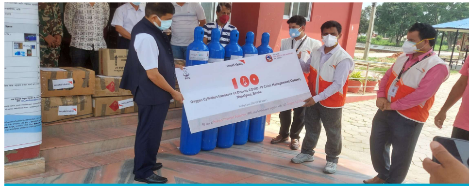
A World Vision staff delivers medical equipment including 100 oxygen cylinders to the District COVID-1 Crisis Management Center of Banke on 6 June 2021.