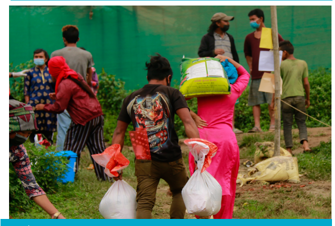
People take home food supplies received from World Vision at Chandragiri, Kathmandu on 17 June 2021.

A vehicle disseminating awareness messages on COVID-19 throug megaphone and posters in Sarlahi district.