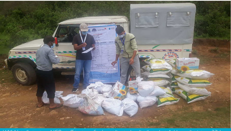
WVI Nepal's partner NGO staff prepare food supplies to be distributed at Achham district on 27 June