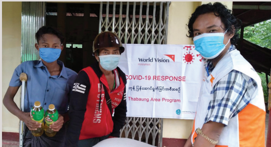
A World Vision staff hand overs rice bags and cooking oil to the community in Thabaung Area Programme.