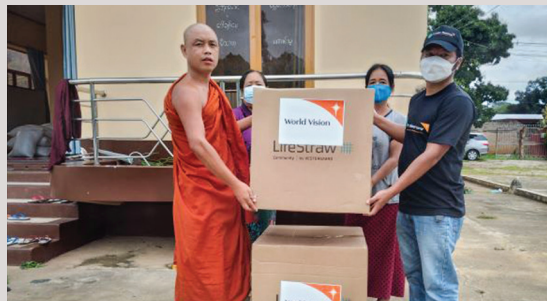
A World Vision staff delivers Lifesraw water purifiers to the community in Demoso Area Programme.