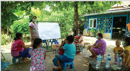
A World Vision staff shares nutrition awareness to the community in Hlegu Area Programme.