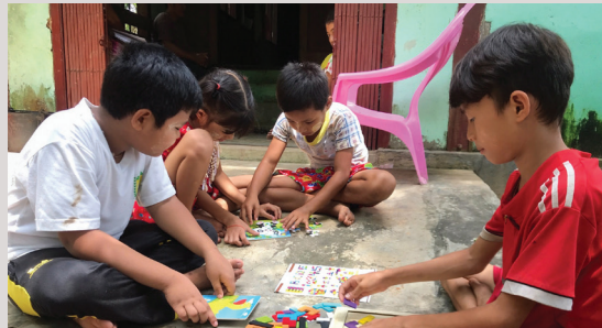
Children are learning and playing with educational materials provided by World Vision.