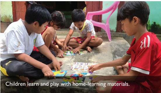
Children learn and play with home-learning materials.