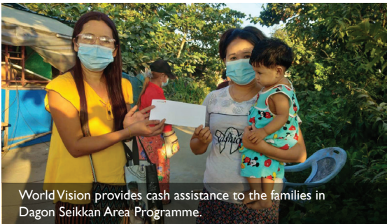
World Vision provides cash assistance to the families in Dagon Seikkan Area Programme.