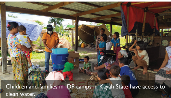
Children and families in IDP camps in Kayah State have access to clean water.