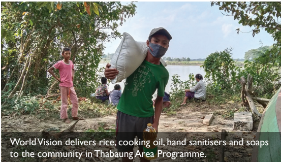
World Vision delivers rice, cooking oil, hand sanitisers and soaps to the community in Thabaung Area Programme.