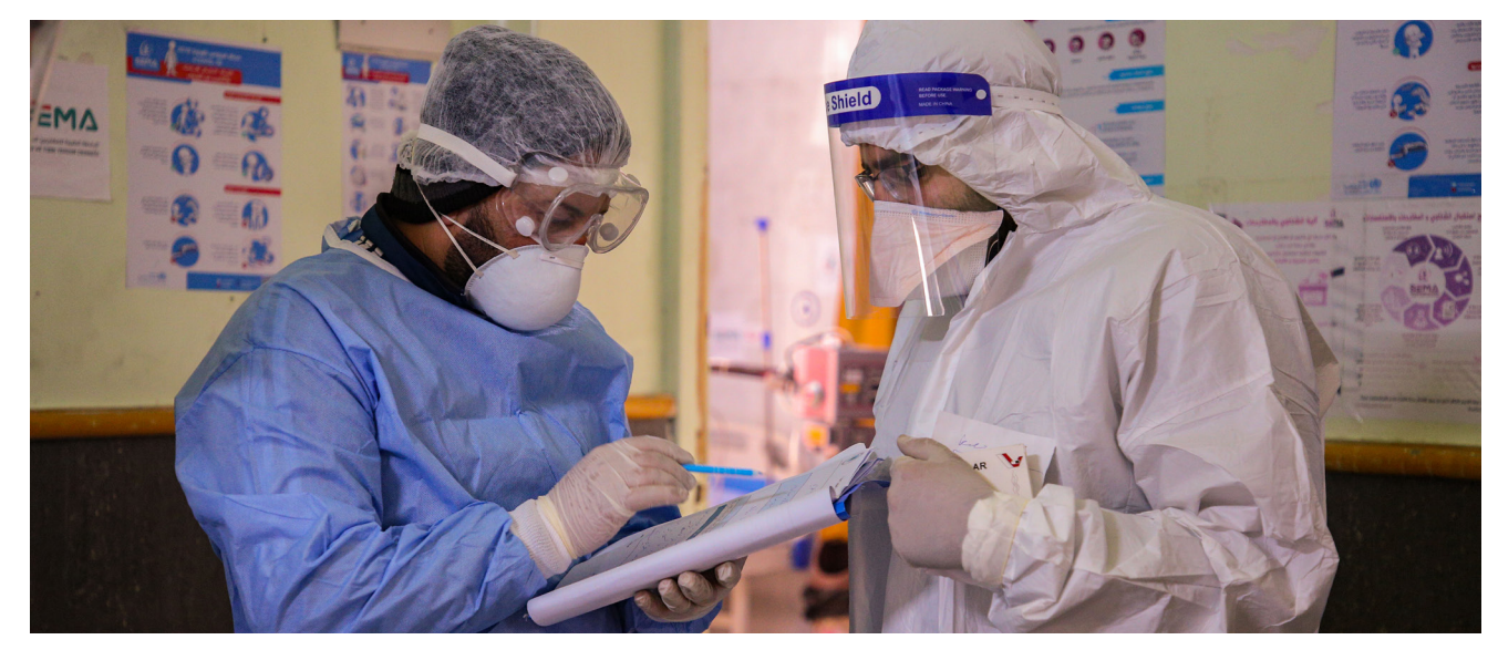
Doctors providing care and support to internally displaced Syrians at a COVID-19 hospital in Northwest-west Syria. The COVID-19 response project is funded by the Disaster Emergency Committee.