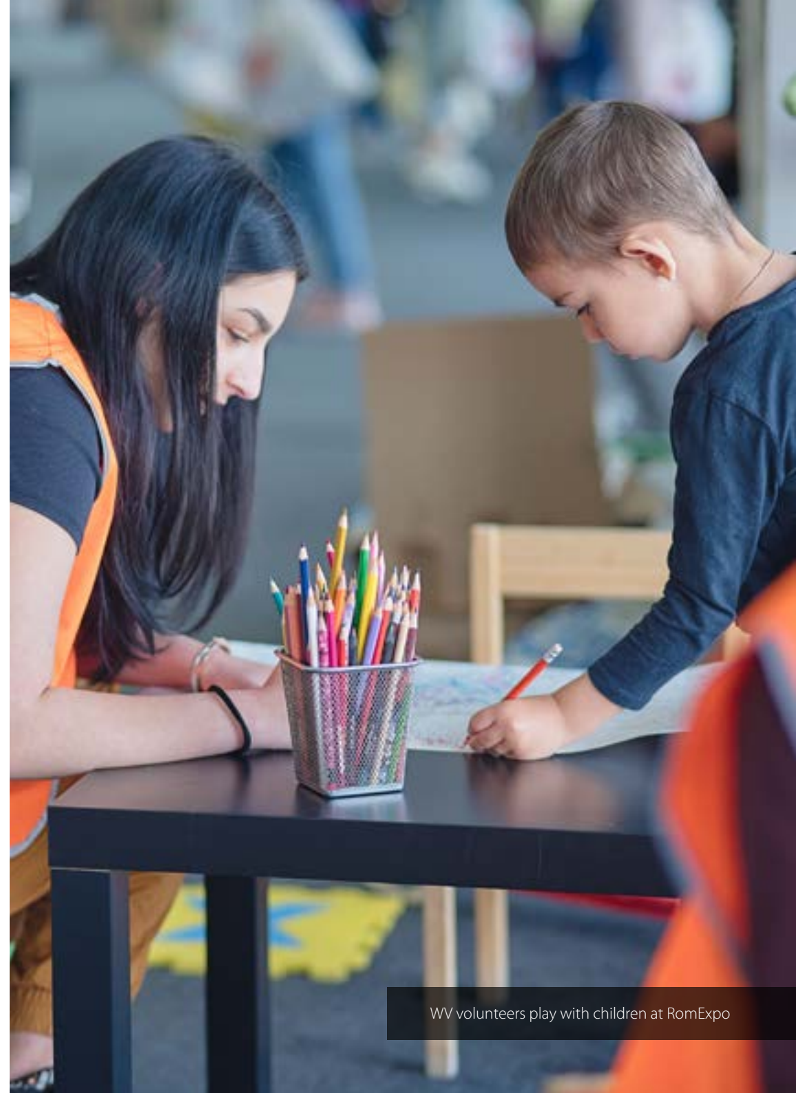
WV volunteers play with children at RomExpo

For any media requests, please email kate_shaw@wvi.org