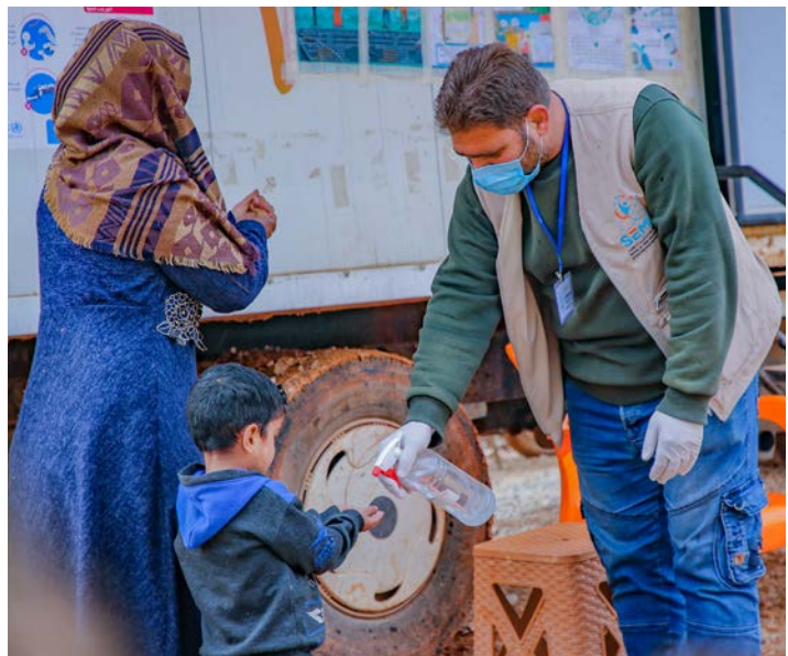
An internally displaced child in Syria benefitting from the health service provided by the mobile clinic.

World Vision Syria Response partnered with the World Health Organization and Assistance Coordination Unit and the COVID-19 EWARDS system to identify cases, provide testing services and support laboratories to function safely and adequately while managing COVID-19 testing.