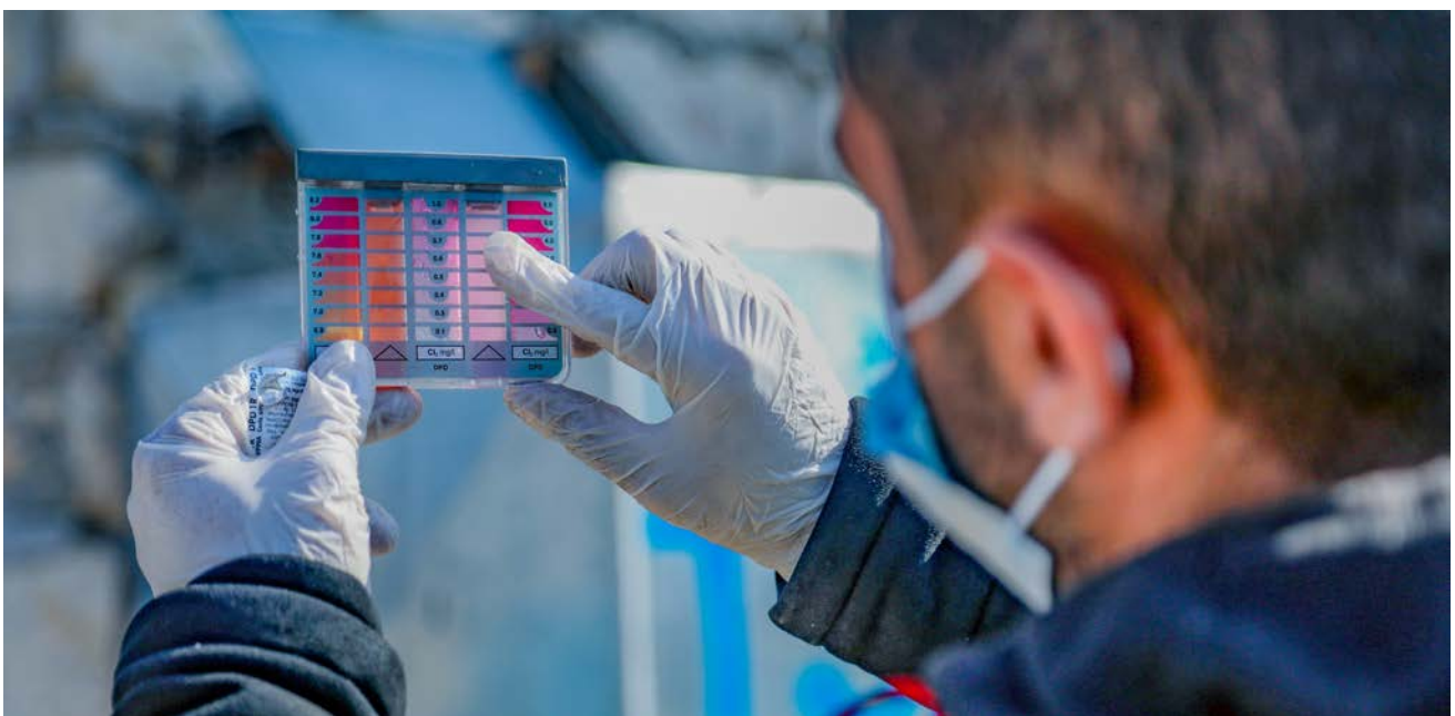
A water and sanitation staff is measuring the clarity of the water. The percentage of chlorine is measured to make sure it is safe for human consumption.

partnerships with community-based partners. We have worked towards rehabilitating and upgrading sanitation facilities and deteriorated septic systems and exploring opportunities to connect vulnerable shelters to secure sewer networks.